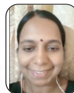
Knowledge FM by Remya M.L