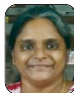
Film Club by Reethi P