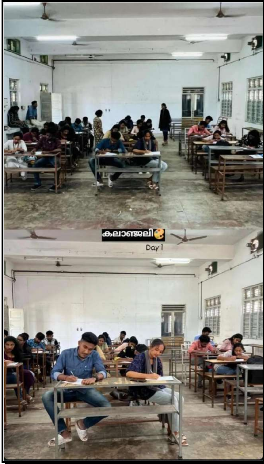
Figure 13: Kalanjali, Cultural Nurturing at Mini Hall