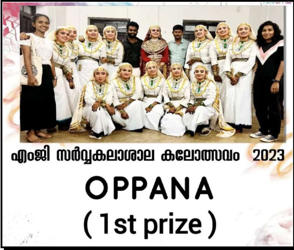
Figure 15: Team Oppana