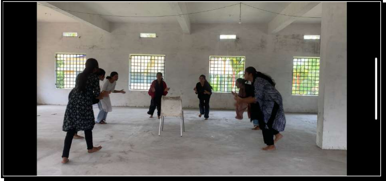
Figure 14: Oppana practice at Block D Rehearsal Hall