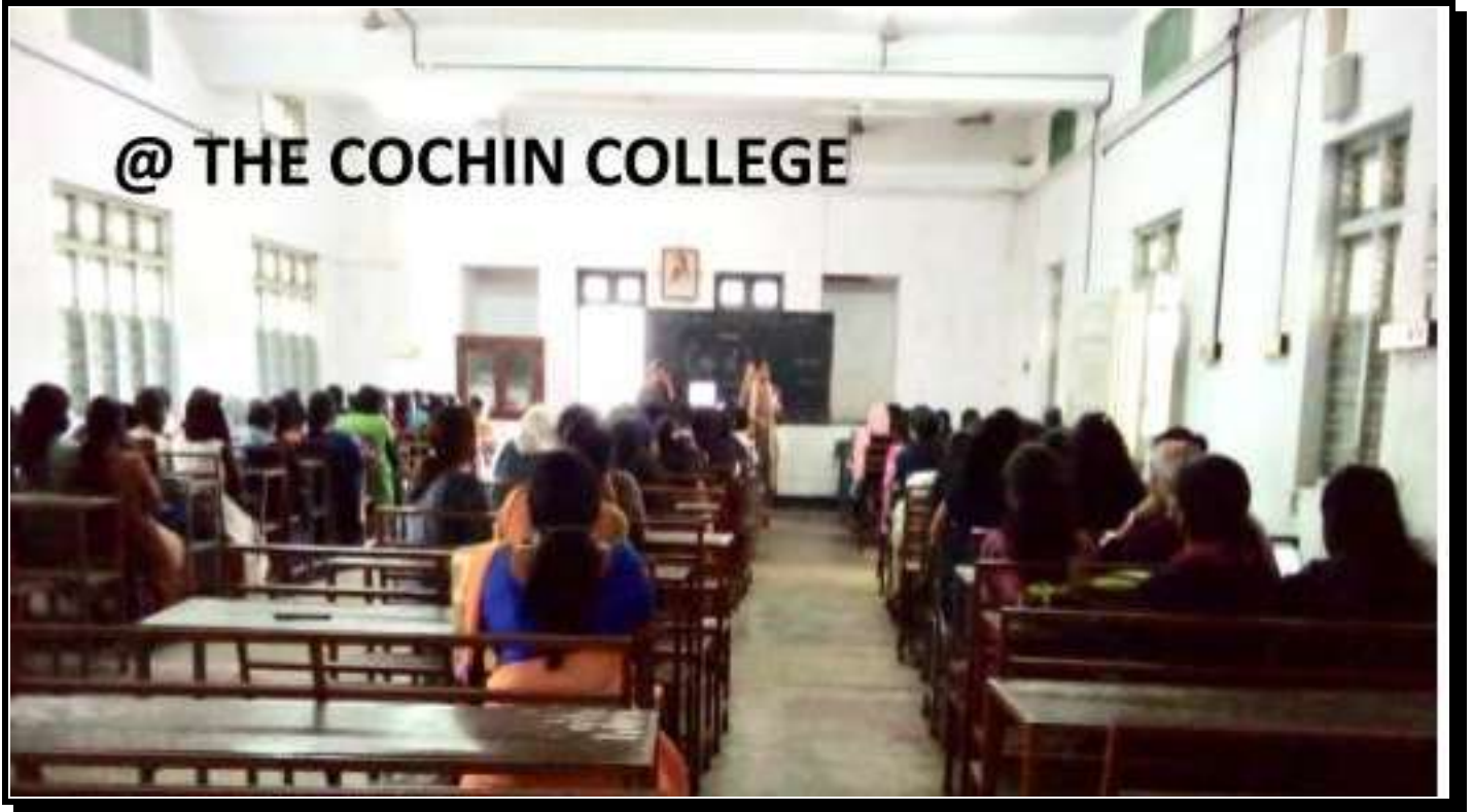
Figure 11: Skill Training For Students at Mini Hall