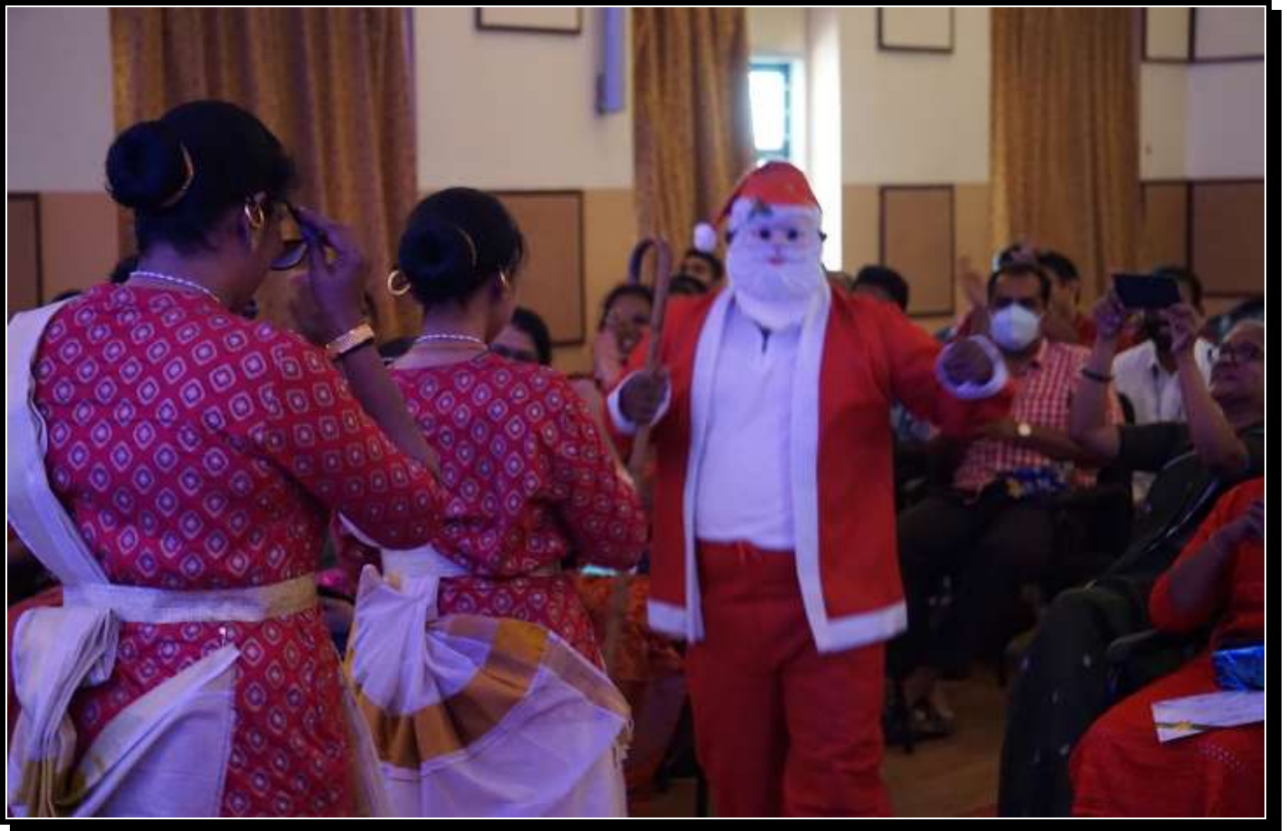
Figure 7: Welcoming "Christmas" at Seminar Hall