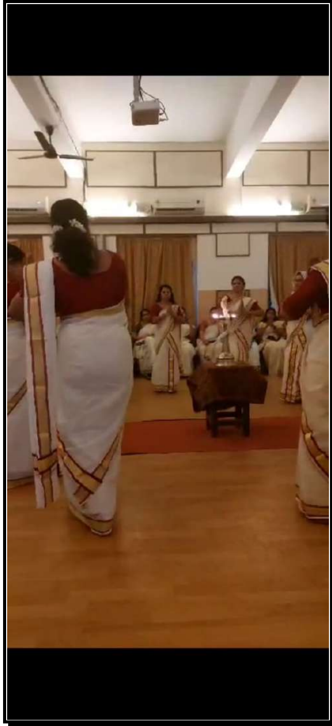
Figure 10: Cultural Events in the Seminar Hall