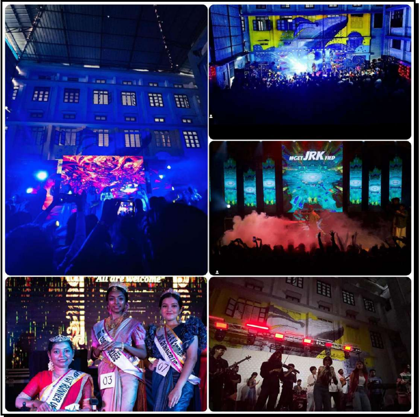
Figure 6: Cultural Events in the Atrium at The Cochin College.