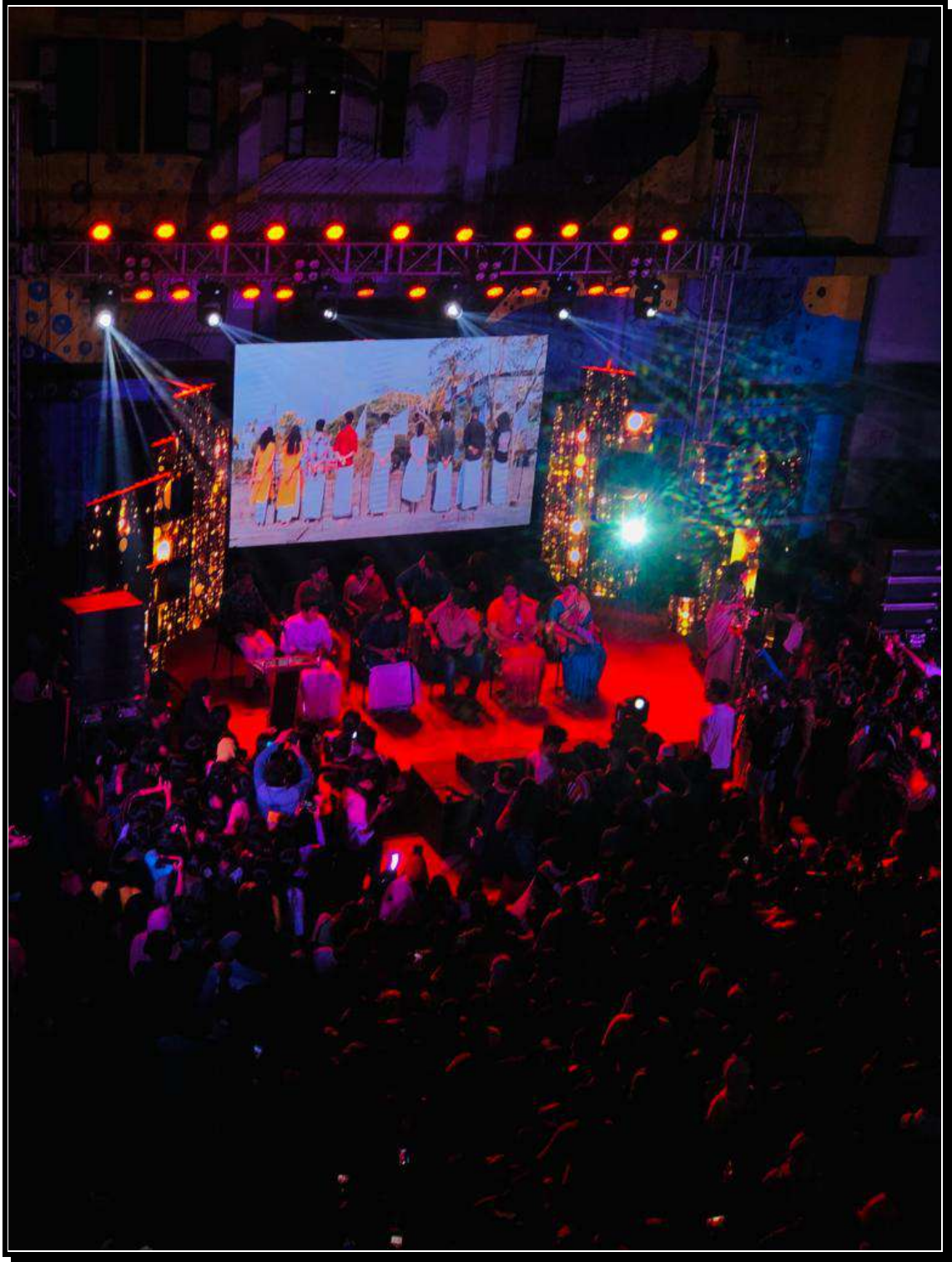
Figure 5: Inauguration of the College Union in the Atrium at The Cochin College.