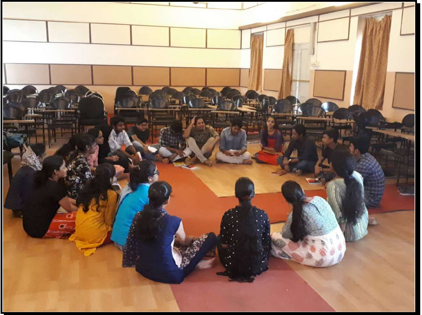
Figure 9: Students engaged in group activity at Seminar Hall