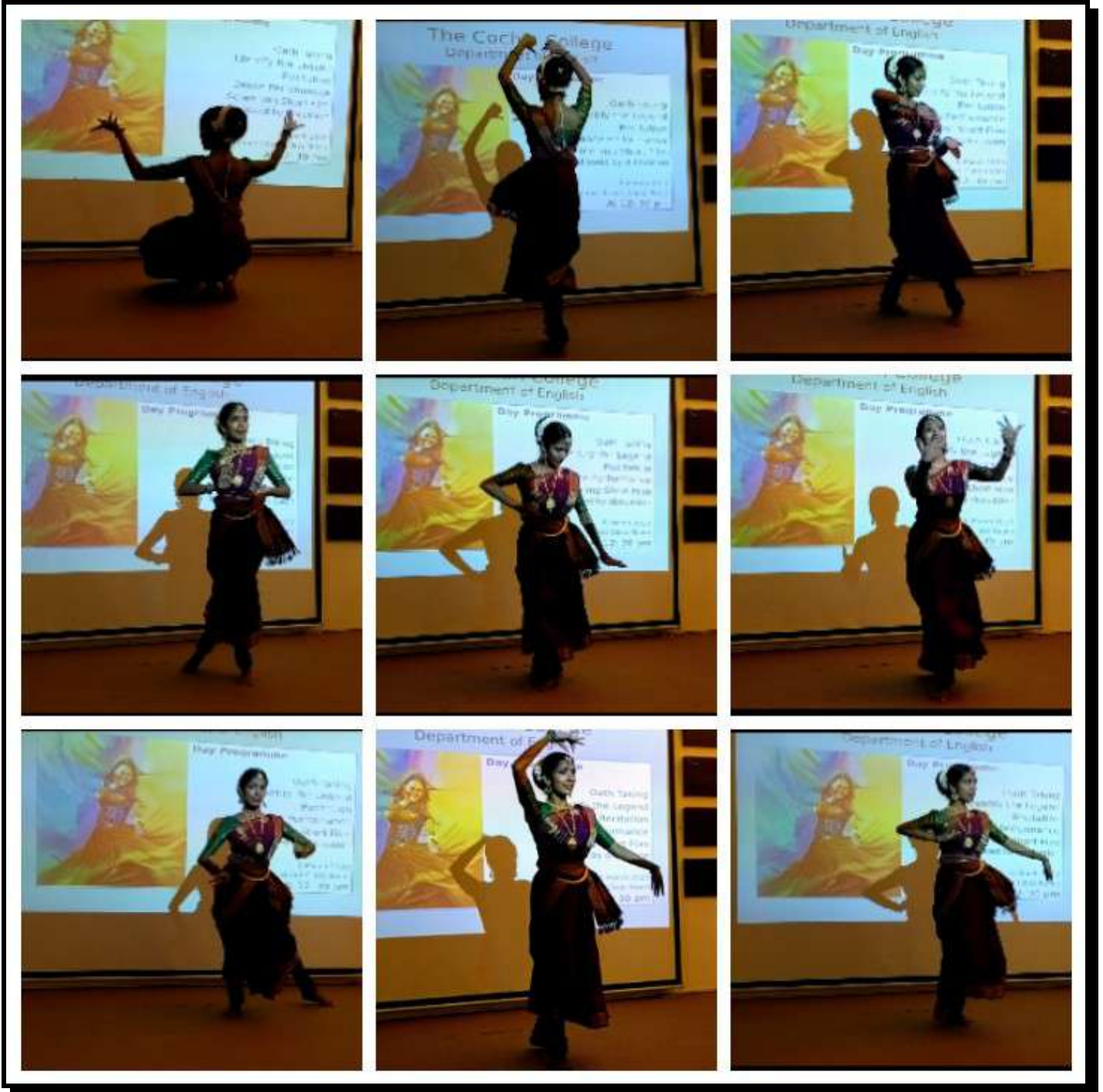
Figure 8: A dance performance at Seminar Hall