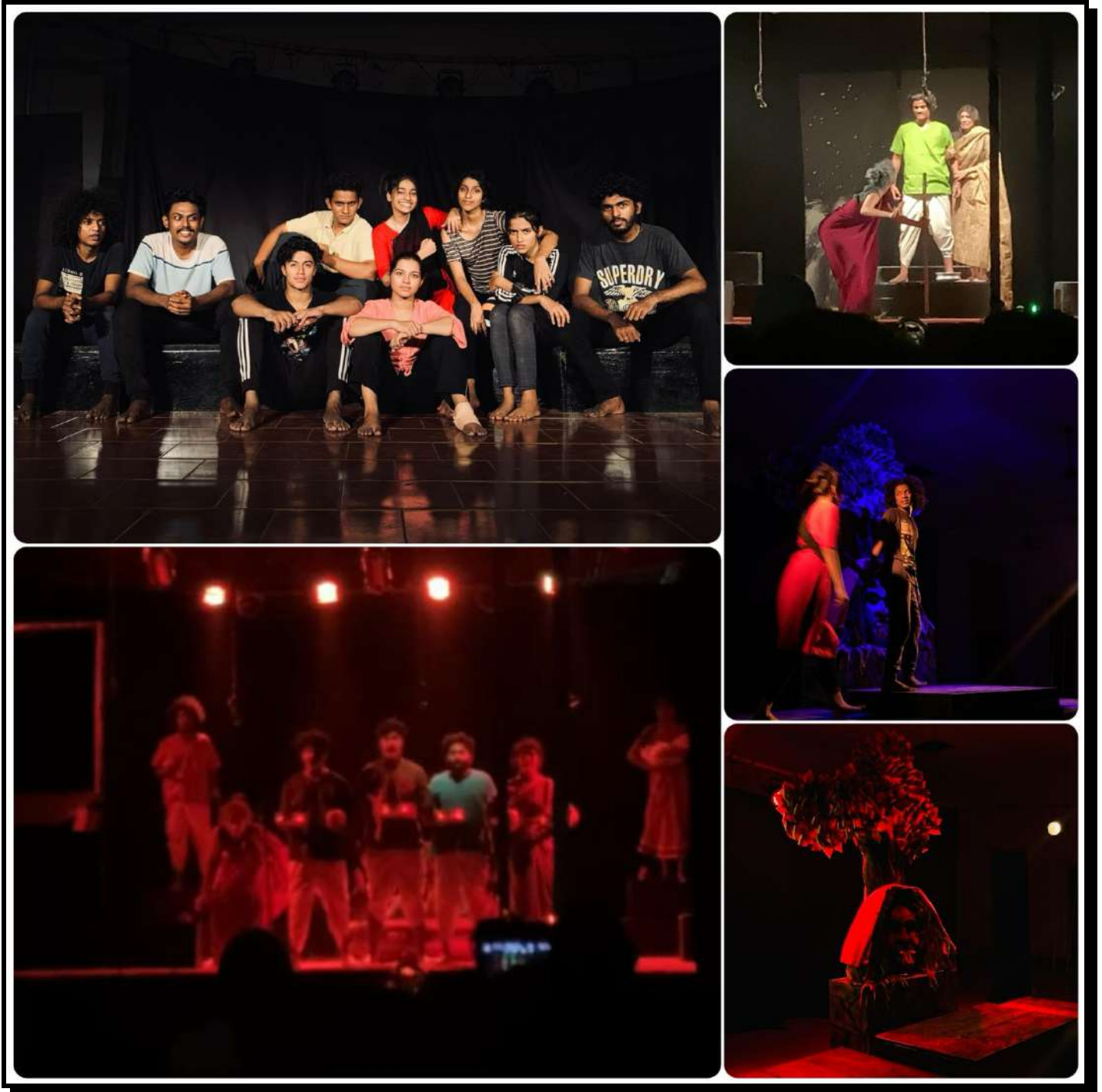
Figure 2: Drama On Air: Unveiling Talent at The Cochin College Auditorium