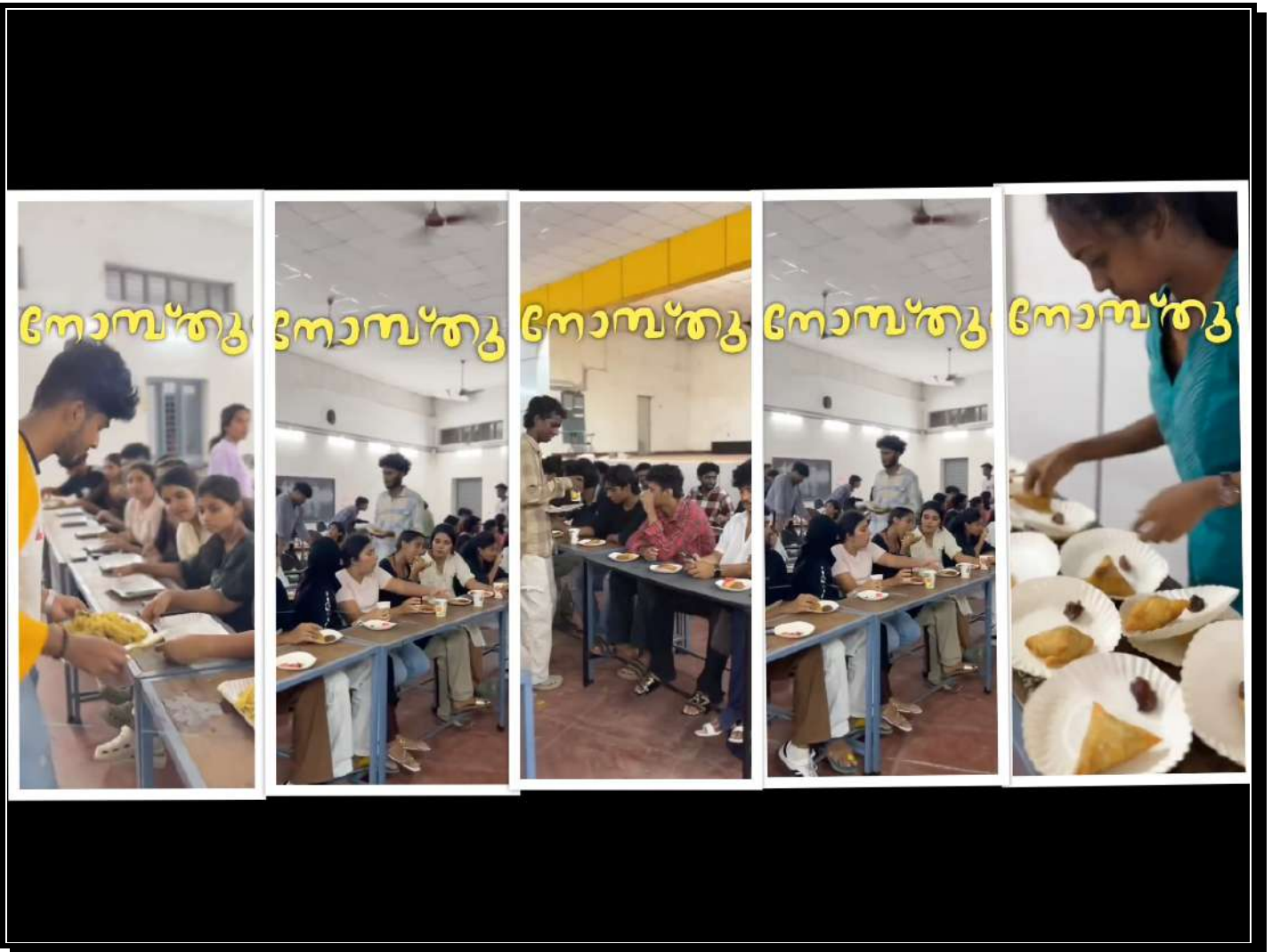
Figure 3: Embracing Unity: Celebrating Iftar Together at The Cochin College Auditorium