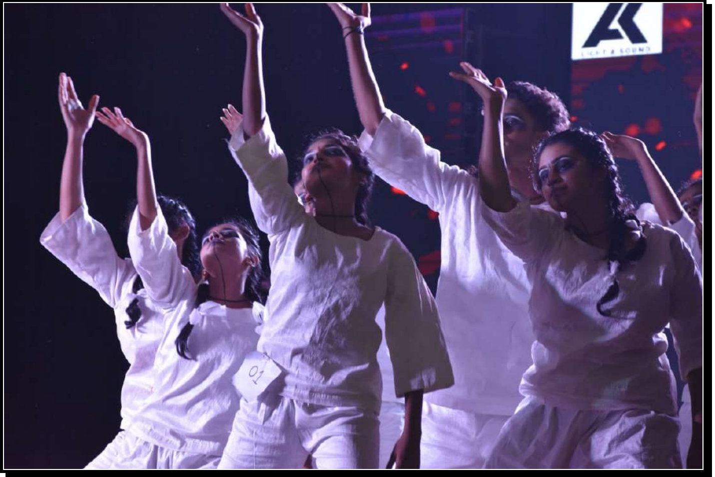
Figure 1: Group Dance at The Cochin College Auditorium