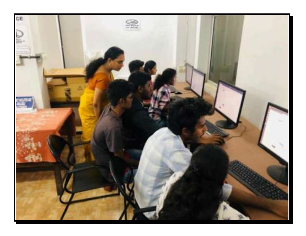
Figure 6: Resource sharing center in the library