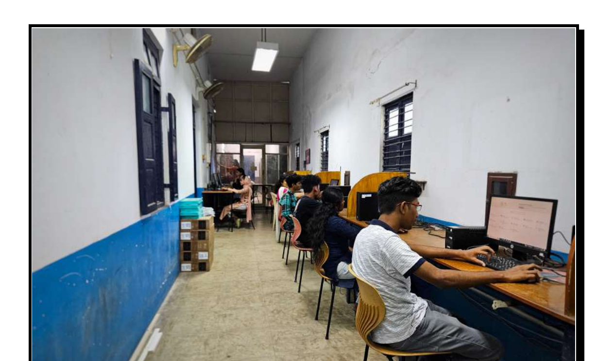
Figure 4: Computer Lab in the Physics Department