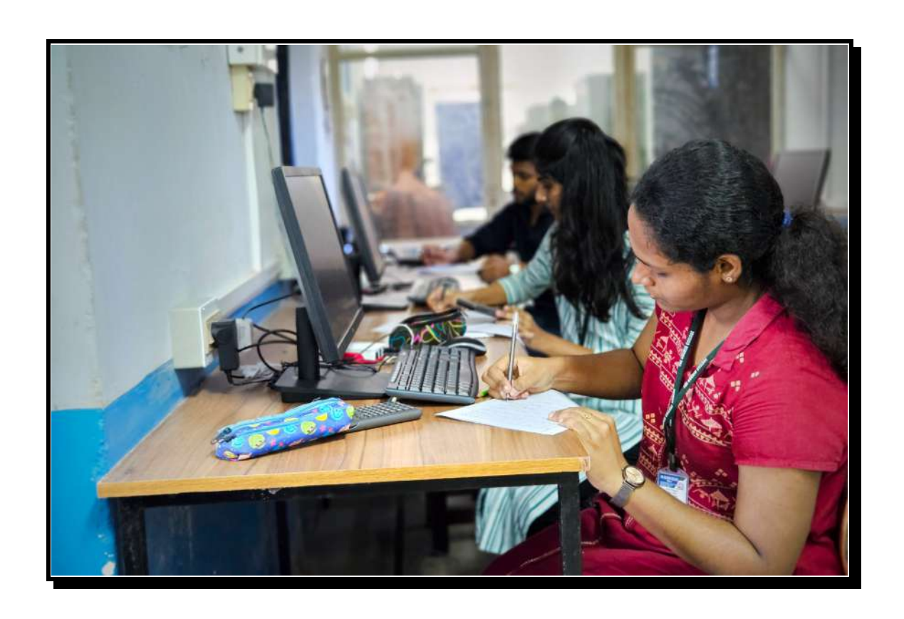
Figure 5: Py Lab:Computer Lab in the Physics Department