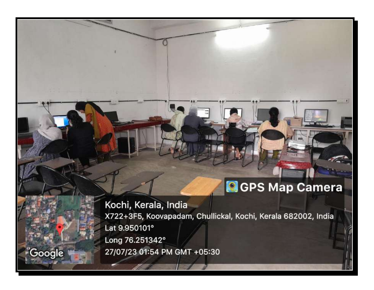
Figure 7: Computer lab in the Chemistry Department