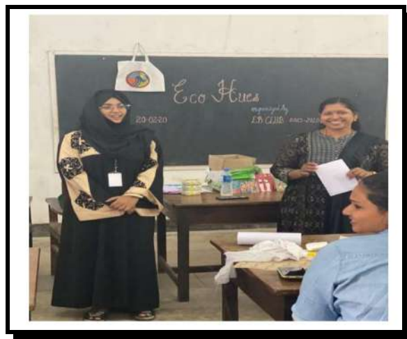
Figure 4: Hands on Workshop-Eco Hues

The Entrepreneurship Development Club (ED Club) of The Cochin College organized a hands-on workshop titled "Eco Hues" on 20th February 2020. The event was aimed at promoting eco-friendly practices and enhancing the creative skills of the participants. The primary objective of the Eco Hues programme was to encourage sustainable practices among students by teaching them the art of cloth bag making and painting. This initiative was in line with the global emphasis on reducing the use of plastic and promoting the use of reusable materials.