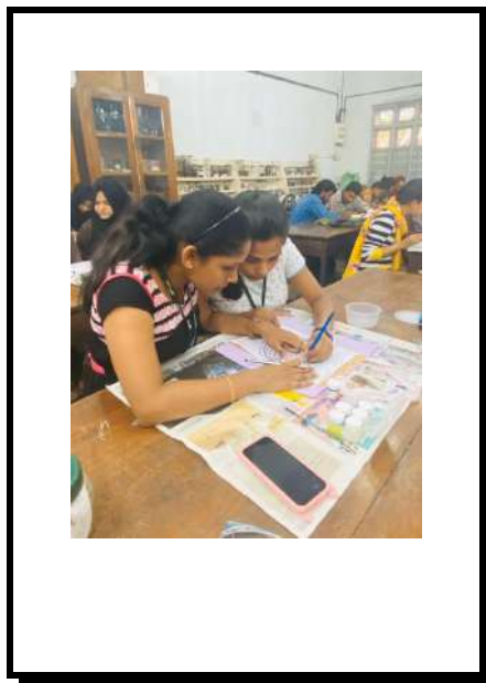
Figure 5: Hands on Workshop-Eco Hues