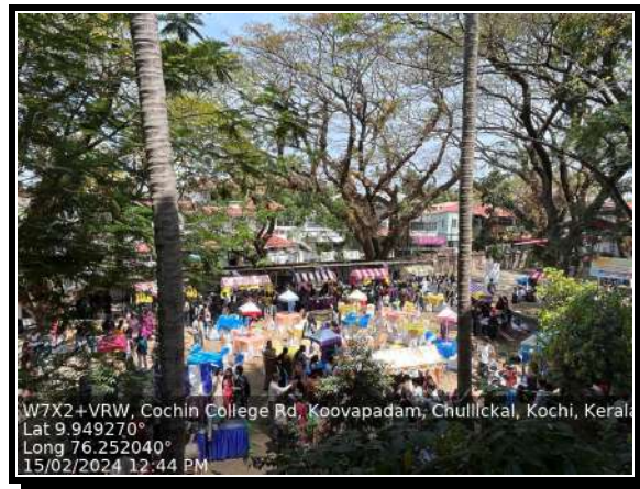
Figure 2: Peppersav 2024

Since 2016, the ED Club, in collaboration with the Department of Commerce, has been organizing an annual food festival named “Peppersav.” This event serves as a platform for students to showcase their culinary talents and entrepreneurial skills. The latest edition of Peppersav was successfully conducted on 07th February 2023, drawing significant participation from students and faculty alike. The festival not only provided a practical experience in entrepreneurship but also highlighted the importance of innovation and creativity in the food industry.