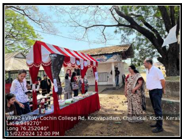
Figure 3: Peppersav 2024