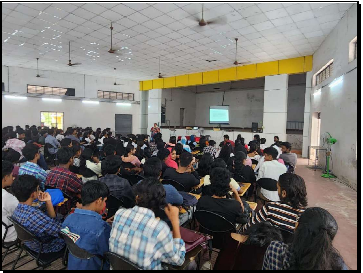
Figure 3: Invited lecture during INIZIO 2023 at The Cochin College Auditorium

The Cochin College features an auditorium equipped with a green room, providing a well-rounded space for performances, events, and presentations. The auditorium serves as a key venue for various college activities, from cultural events to academic ceremonies, while the attached green room offers performers and speakers a private area for preparation. This setup enhances the functionality and professionalism of events held at the college.