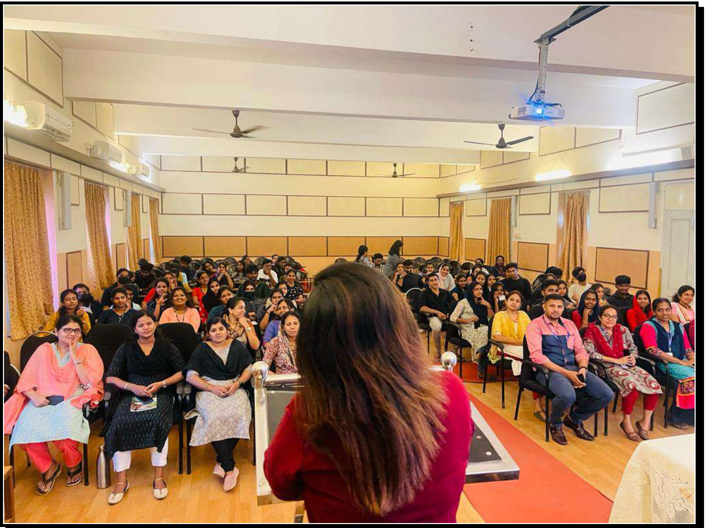
Figure 6: Financial Literacy Club Inauguration at the Seminar Hall

The seminar hall at The Cochin College is a versatile and technologically advanced space, frequently used for a variety of official programs. This ICT-enabled hall is equipped with a high-speed Wi-Fi connection, enhancing its functionality for conducting workshops, talks, and other academic and professional events. The integration of modern technology ensures that presentations and interactive sessions are executed smoothly, making the seminar hall an essential venue for fostering learning and collaboration within the college community.