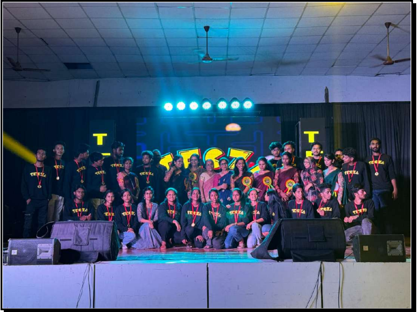
Figure 5: Cordinators of Tecza at The Cochin College Auditorium