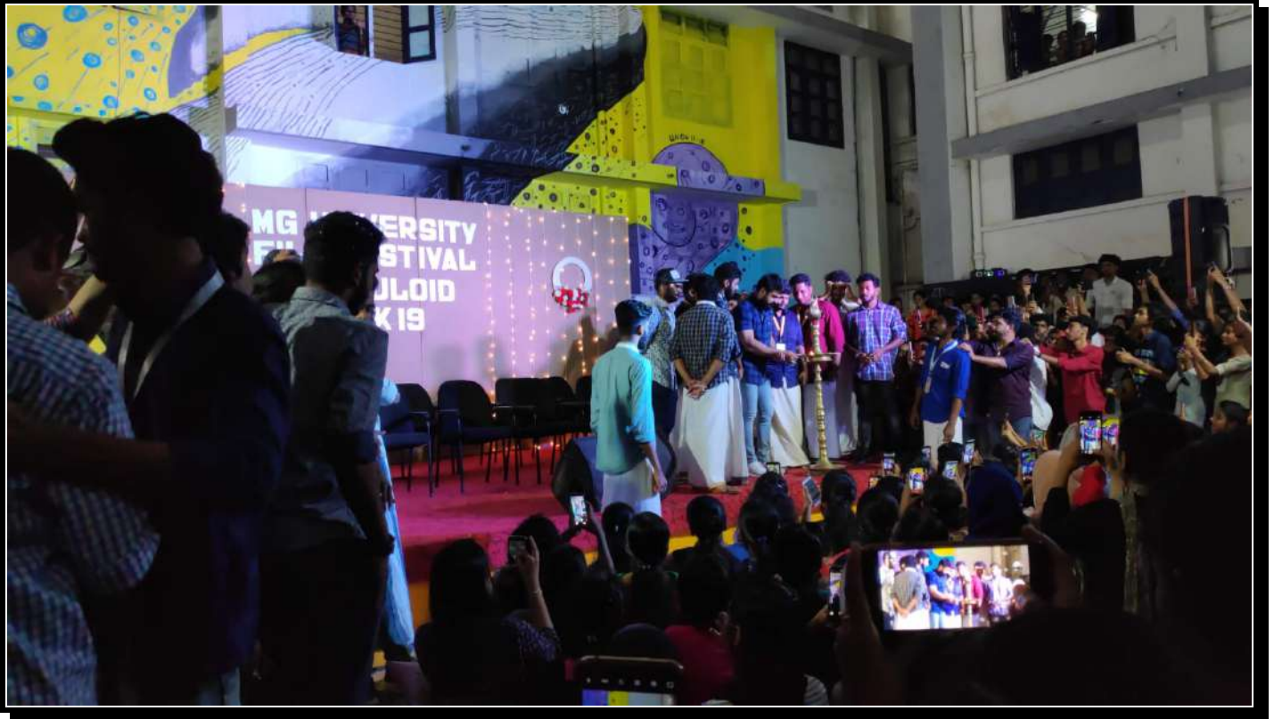
Figure 2: Inauguration of MG University film festival