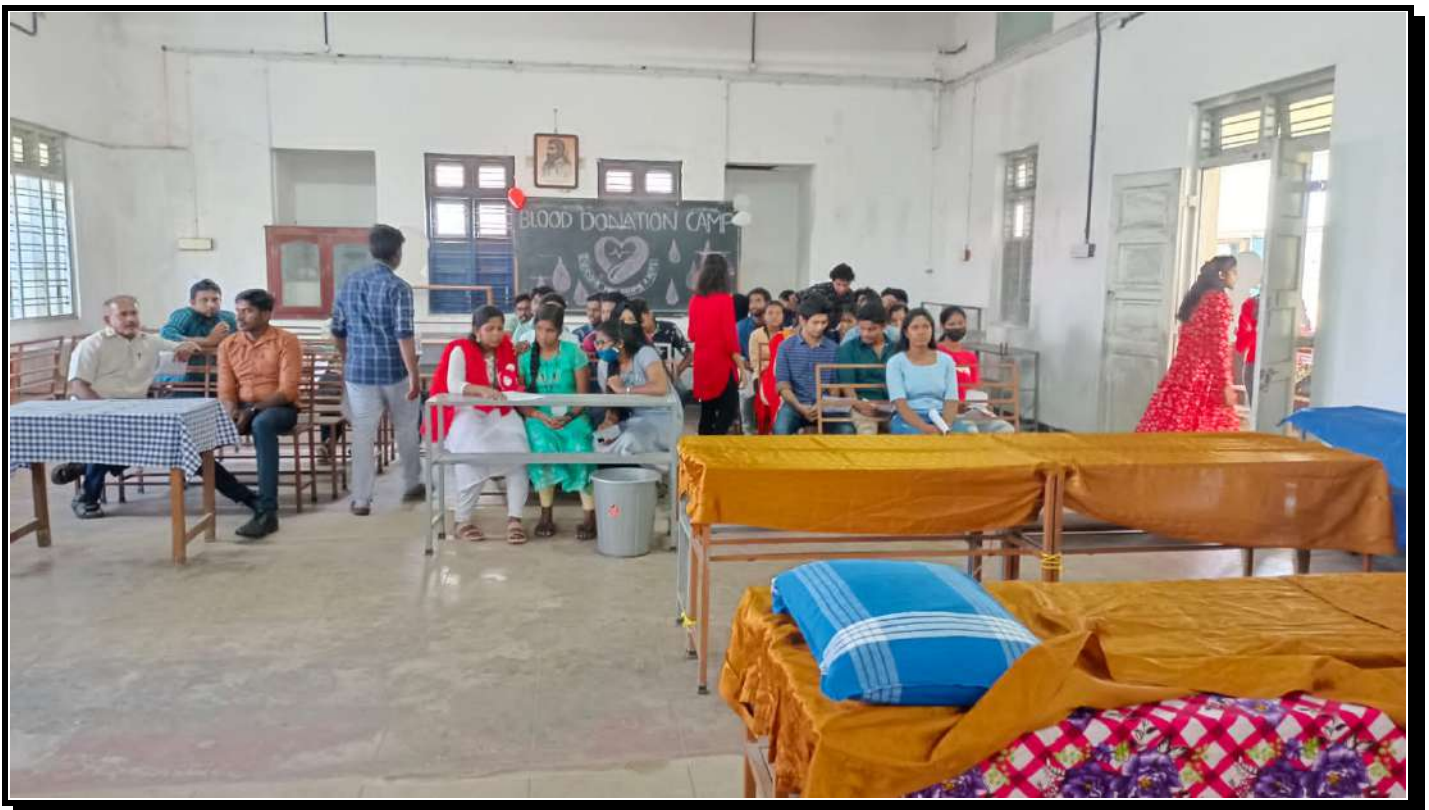
Figure 9: Students at the Mini Hall during Blood Donation Camp

The Mini hall at The Cochin College is a spacious and well-equipped venue designed to support a range of academic activities. Also it serves as a space for both medical initiatives like blood donation camps and educational activities related to health and hygiene awareness. With its comfortable seating arrangement the lecture hall facilitates engaging and interactive lectures, presentations, and seminars. The layout is optimized for effective communication between the speaker and audience, ensuring a conducive environment for learning and discussion. The hall's flexible design make it an essential resource for enhancing the educational experience at the college.