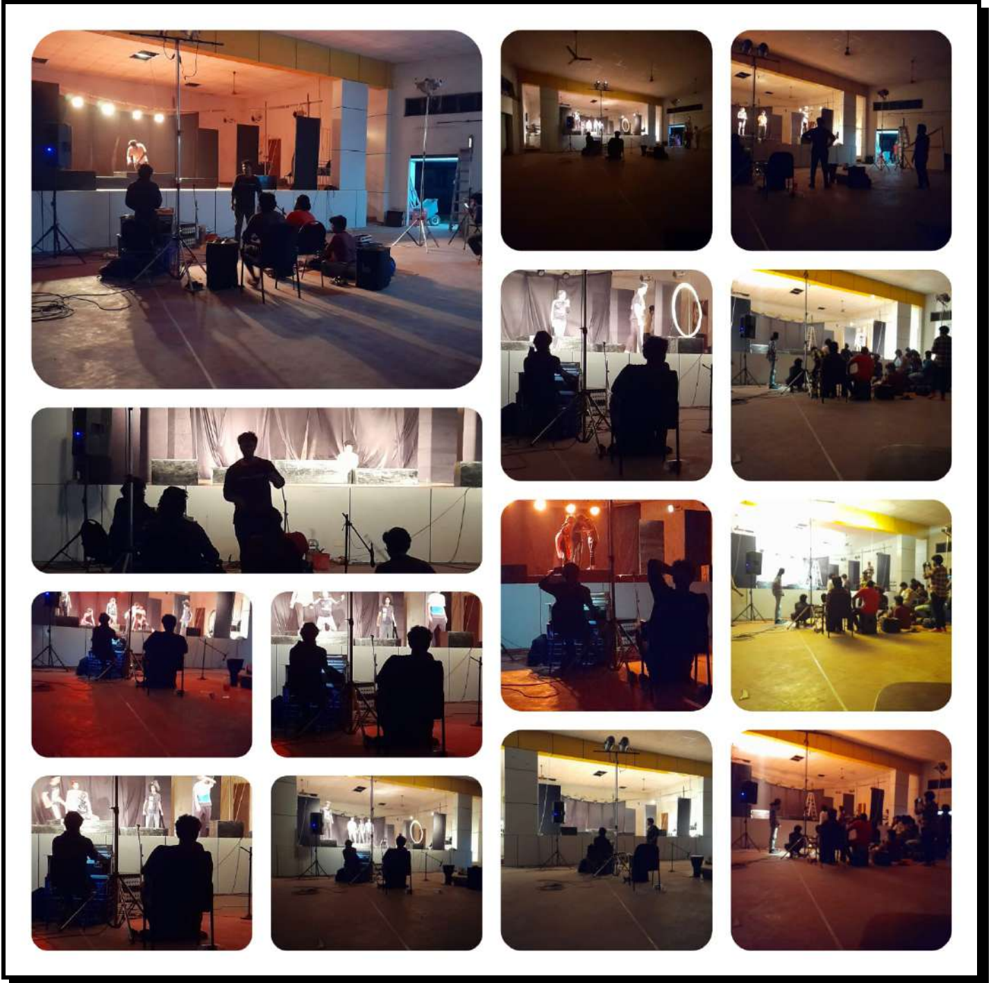
Figure 4: Dress rehearsal of events at The Cochin College Auditorium