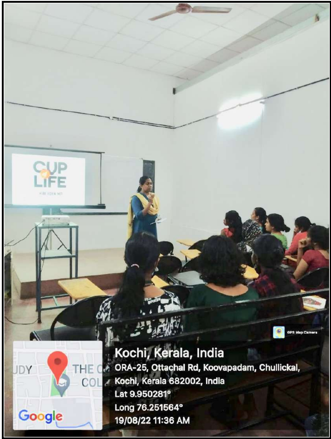
Figure 16: Cup of Life event- awareness session on Menstrual Cup at Mini Conference Hall