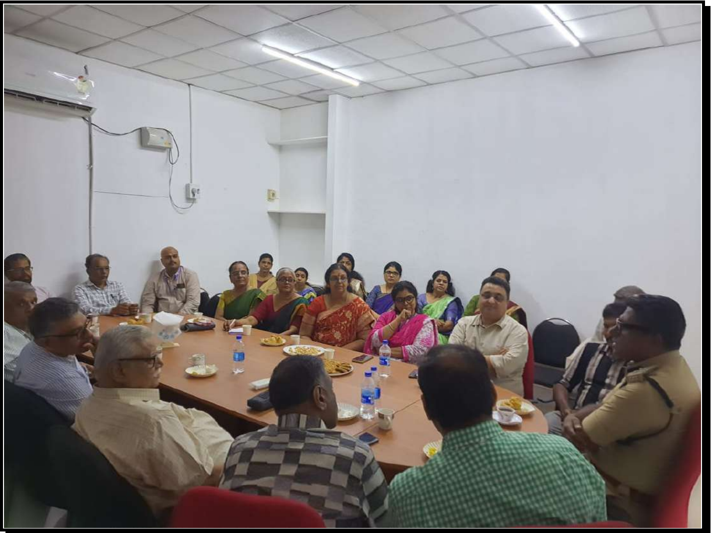
Figure 11: Meeting with management and district administration officer

The Cochin College features a state-of-the-art board room, specifically designed to host high-level discussions, strategic planning sessions, and executive meetings. This exclusive space is equipped with advanced technology and modern amenities, ensuring a productive and comfortable setting for executive-level engagements. The board room provides an ideal environment for important decision-making processes and collaborative efforts among college leadership and external stakeholders.