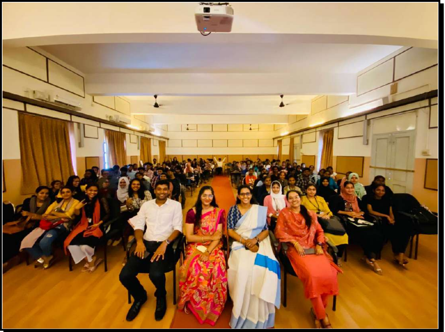
Figure 7: Personality Training For Enhancing Employability