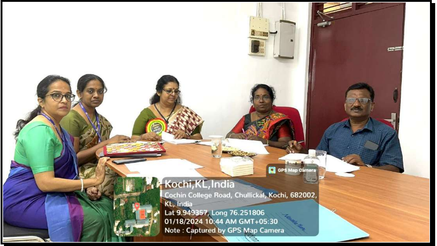
Figure 12: Screening Committee Meeting In Board room