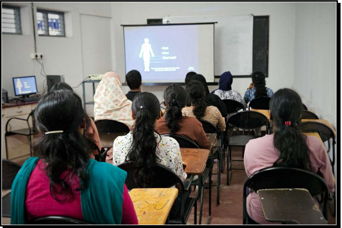
Figure 15: Project presentation at Mini Conference Hall

The mini conference hall in Block F of The Cochin College is an ideal venue for hosting small official programs, such as project presentations and meetings. This intimate space is designed to accommodate focused gatherings, providing a conducive environment for detailed discussions and presentations. The hall's setup ensures that smaller events are conducted smoothly and efficiently, making it a valuable resource for academic and administrative activities within the college.