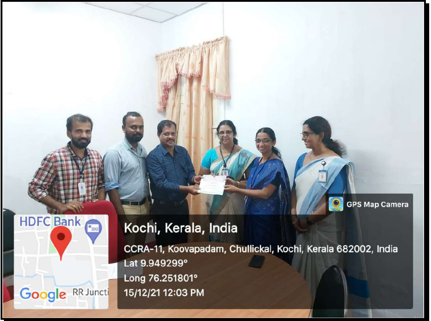
Figure 13: MOU signed between The Cochin College and Aquinas College in the Board room