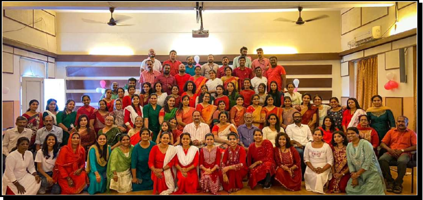
Figure 8: Staff Posing In the Seminar Hall after a Staff meeting