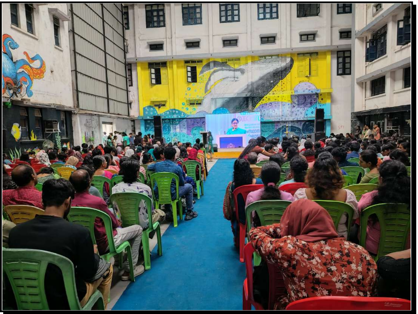
Figure 1: Orientation class for the first year under graduate students and their parents

The atrium at The Cochin College is a central and versatile space that hosts a variety of events, including official programs that engage the entire college community. Its spacious design makes it an ideal venue for large gatherings, ceremonies, and other significant events. The atrium facilitates a wide range of activities, bringing together students, faculty, and staff, and fostering a vibrant atmosphere of collaboration and community within the college.