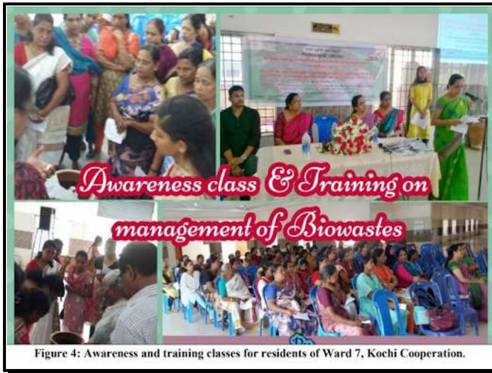
Figure 4: Awareness and training classes for residents of Ward 7, Kochi Cooperation.

*Corresponding author: Manju V Subramanian