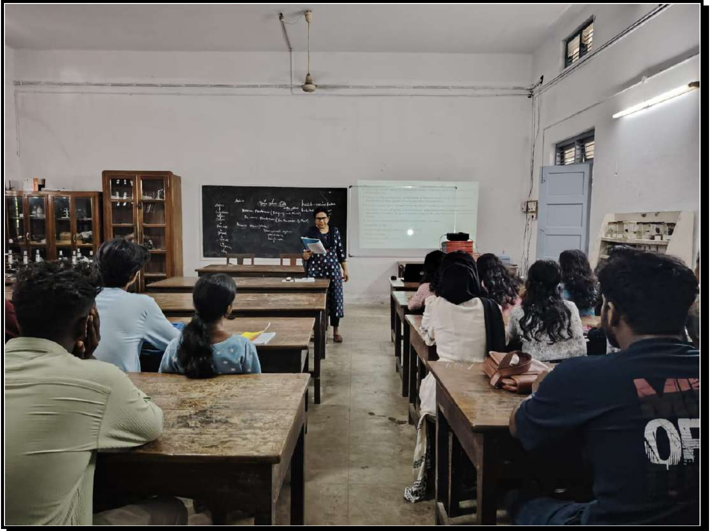
Figure 3: Teacher engaged in explaining laboratory procedure using LCD projector in Under Graduate Botany Laboratory