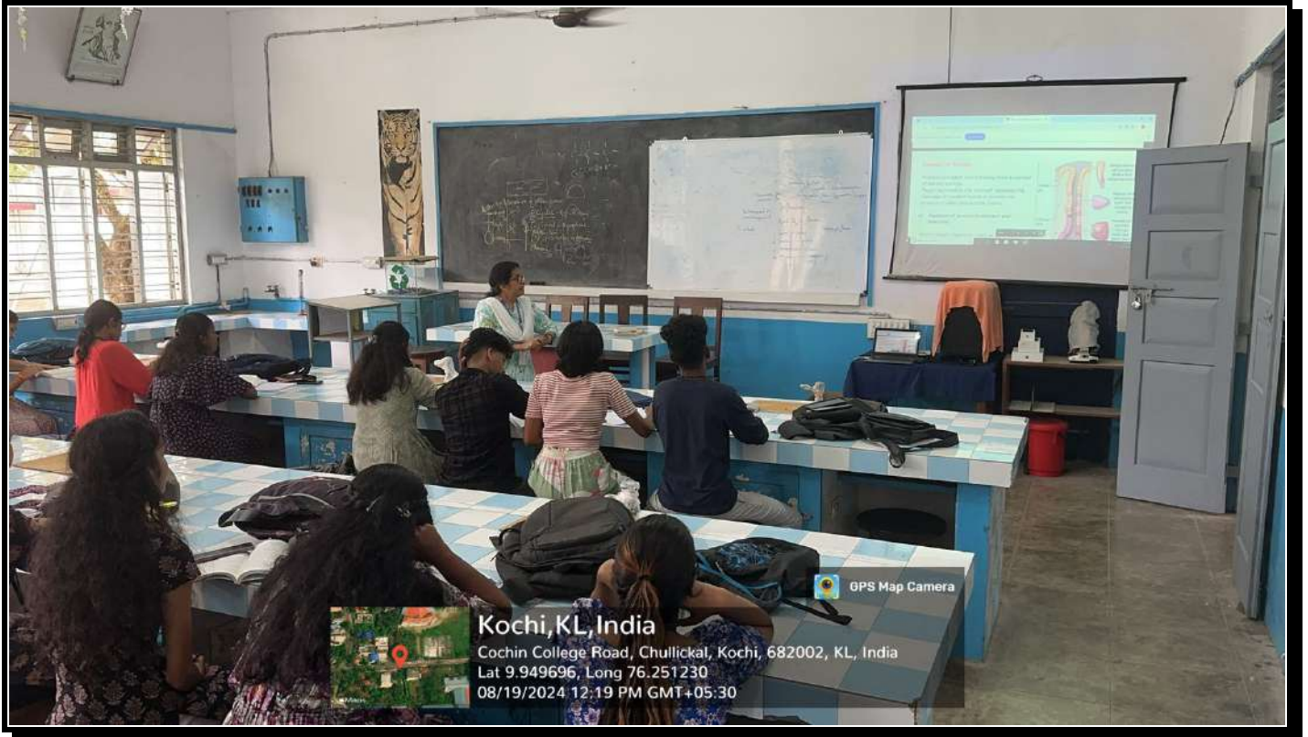
Figure 4: Teacher engaged in explaining laboratory procedure using LCD projector in Under Graduate Zoology Laboratory