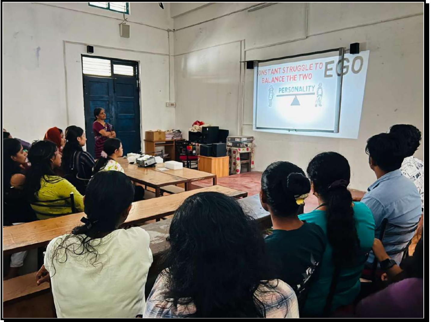
Figure 5: Teacher engaged in taking classes using LCD projector in Post Graduate class room