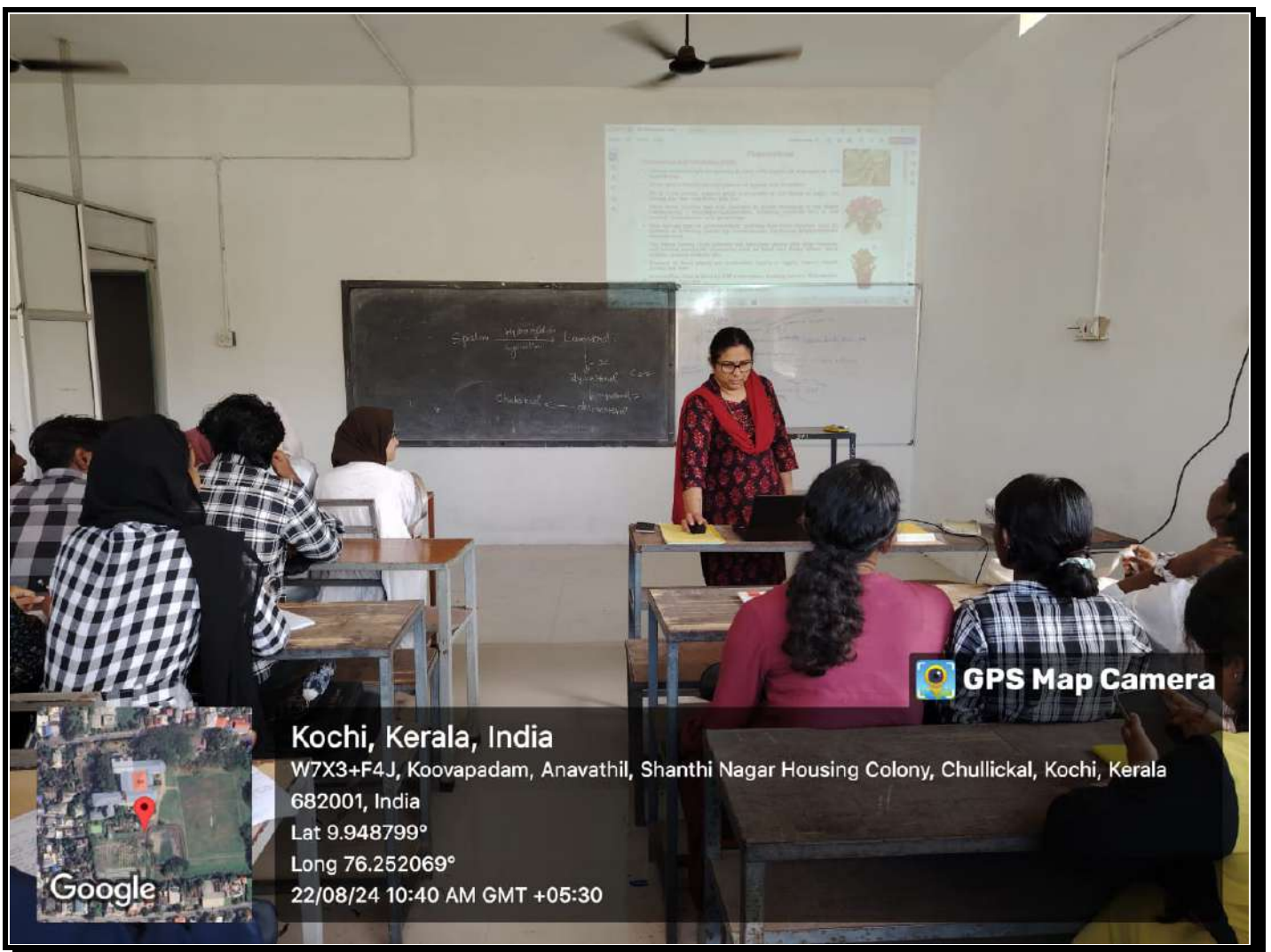
Figure 1: Teacher engaged in taking classes using LCD projector in Under Graduate Botany class room

The Cochin College is equipped with ICT-enabled classrooms. The ICT-enabled classrooms are outfitted with advanced technological tools that facilitate interactive and dynamic learning experiences. These classrooms are equipped with projectors, smart boards, and internet connectivity, allowing for multimedia presentations, online resources, and enhanced student engagement.