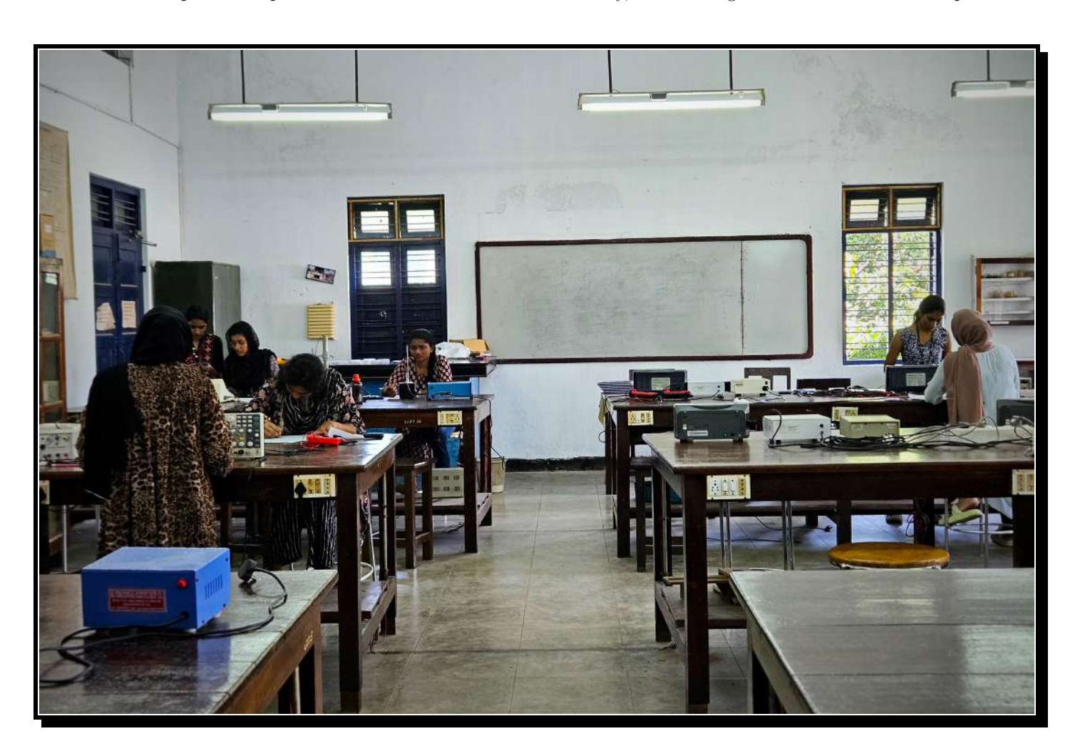
Figure 1: Students engaged in practical sessions in Post graduate Physics laboratory

The laboratories at The Cochin College are state-of-the-art facilities designed to support hands-on learning and research across various disciplines. Each lab is equipped with advanced instruments and technology, providing students with practical experience and fostering a deeper understanding of their subjects. The labs cater to a wide range of academic needs, including science experiments, technical training, and project work. The well-maintained and modern setup ensures that students can perform experiments and research activities effectively, contributing to a robust educational experience.