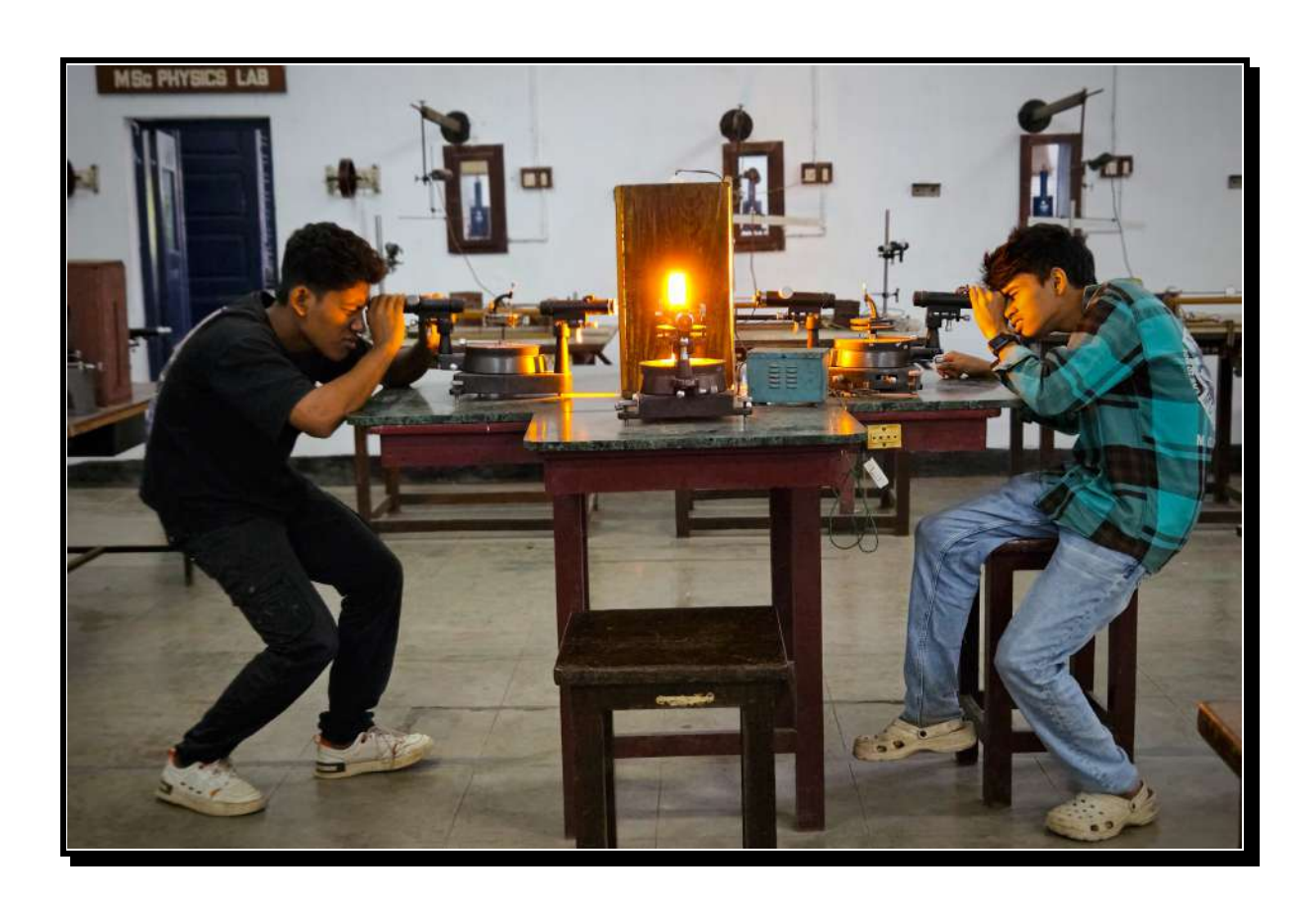
Figure 5: Practical sessions at undergraduate physics laboratory