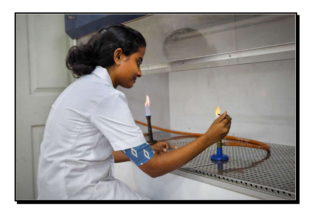
Figure 25: Students conducting practical experiments at Postgraduate Microbiology laboratory