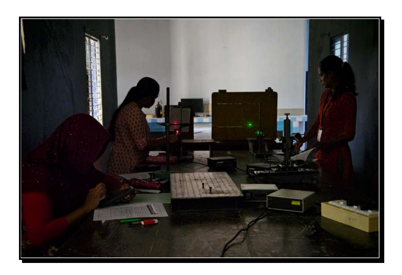
Figure 7: Practical sessions in dark room in Physics laboratory