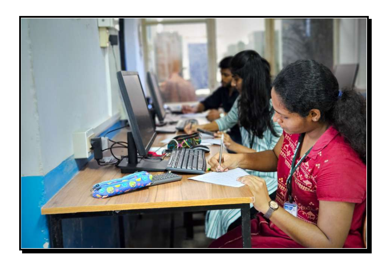
Figure 10: Py Lab: Computational Physics practical sessions