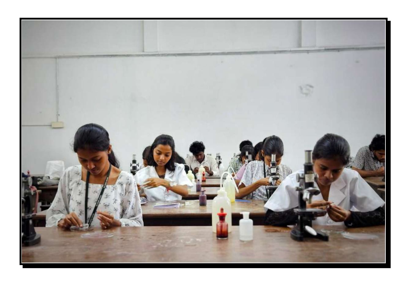
Figure 17: Students examining specimen during practical session at Botany laboratory