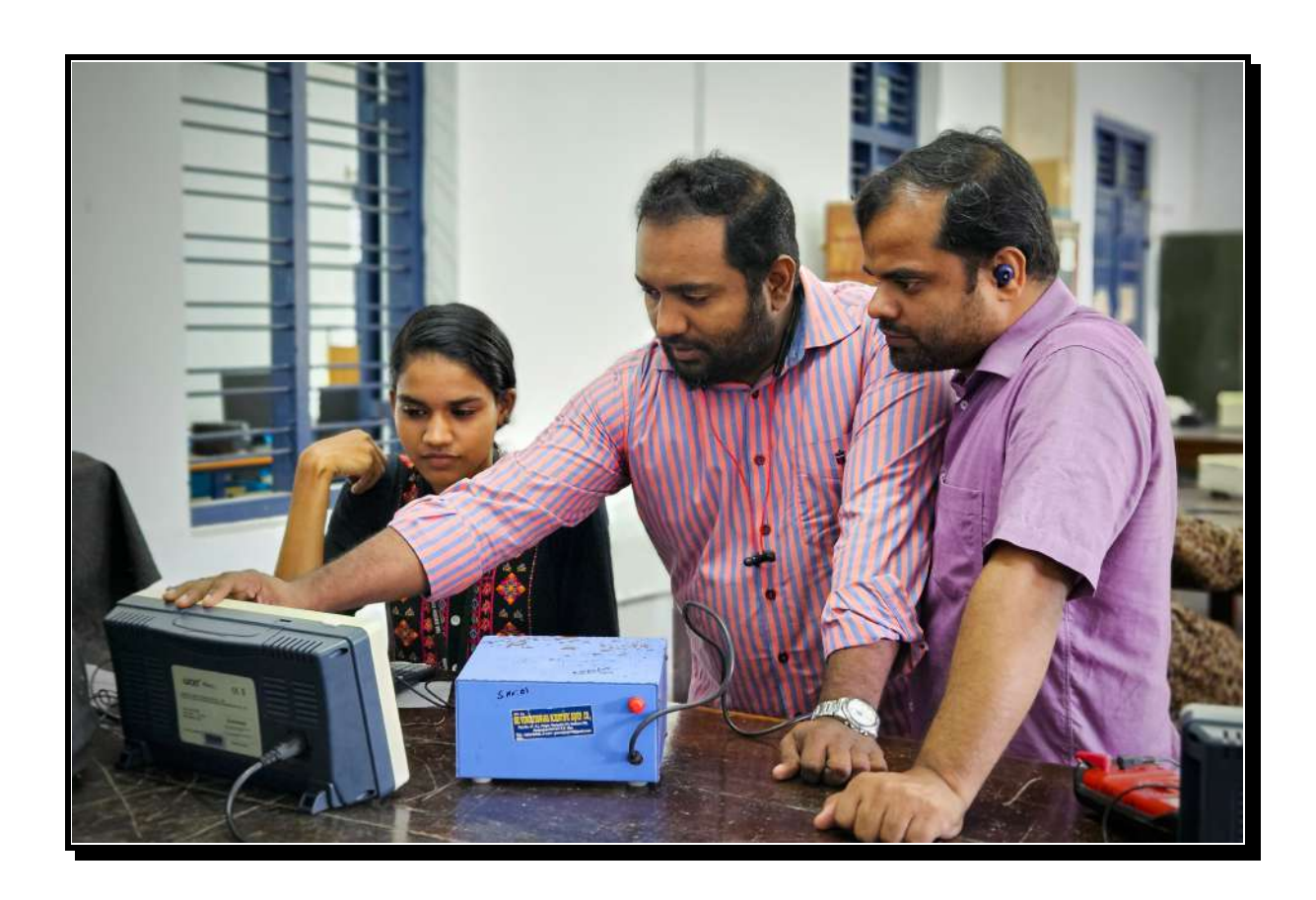
Figure 2: Teachers assisting in Post graduate Physics laboratory