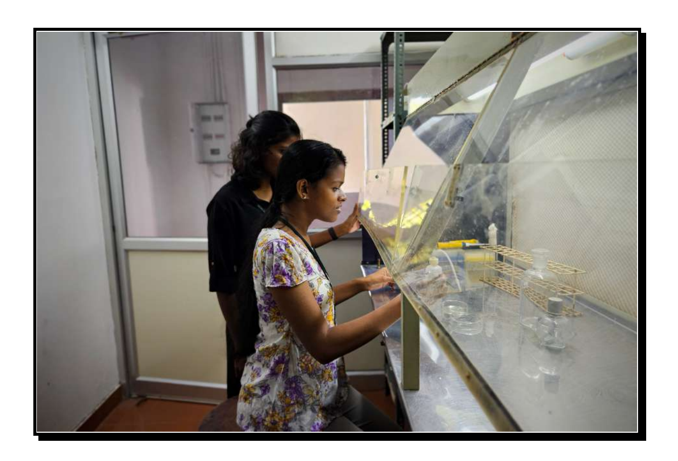
Figure 18: Tissue culture laboratory