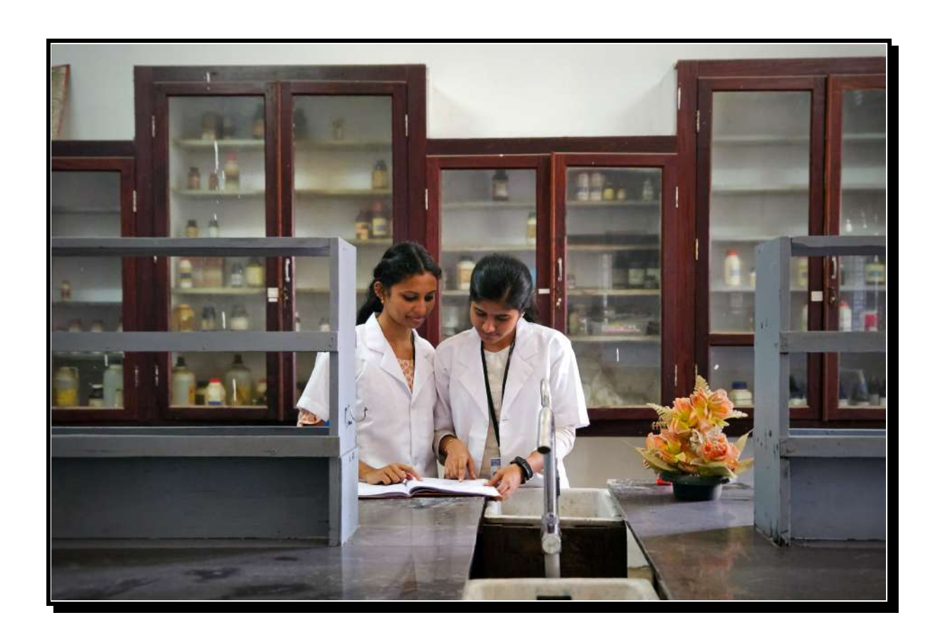
Figure 16: Physical chemistry laboratory