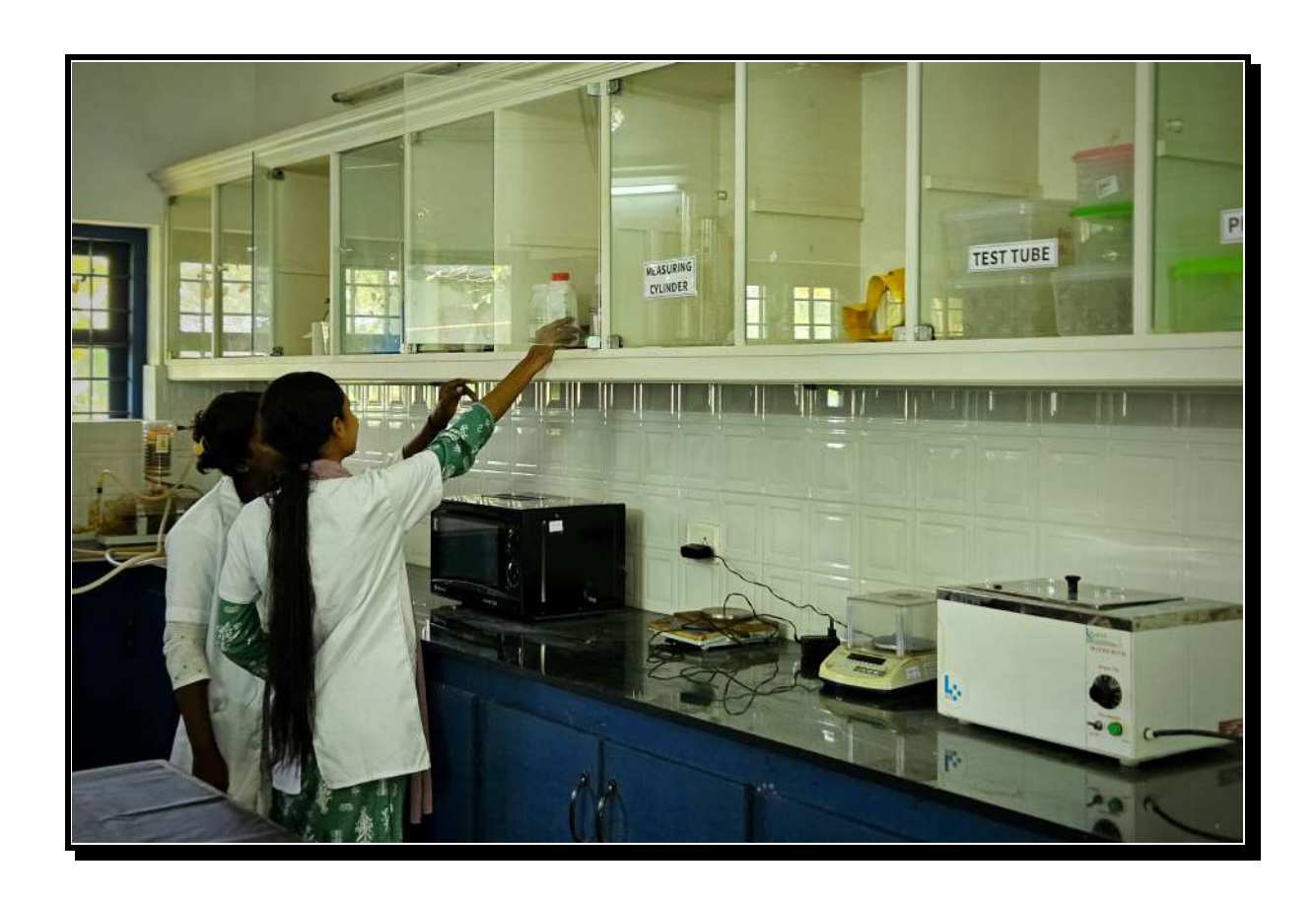
Figure 22: Microbiology-ADD On Zoology laboratory