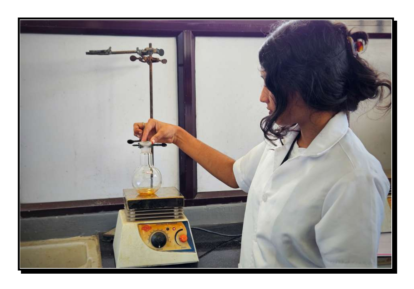
Figure 15: Students conducting practical experiments at undergraduate chemistry laboratory