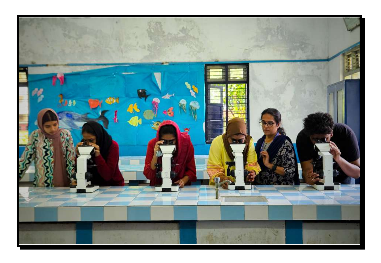
Figure 21: Students conducting practical sessions at undergraduate Zoology laboratory