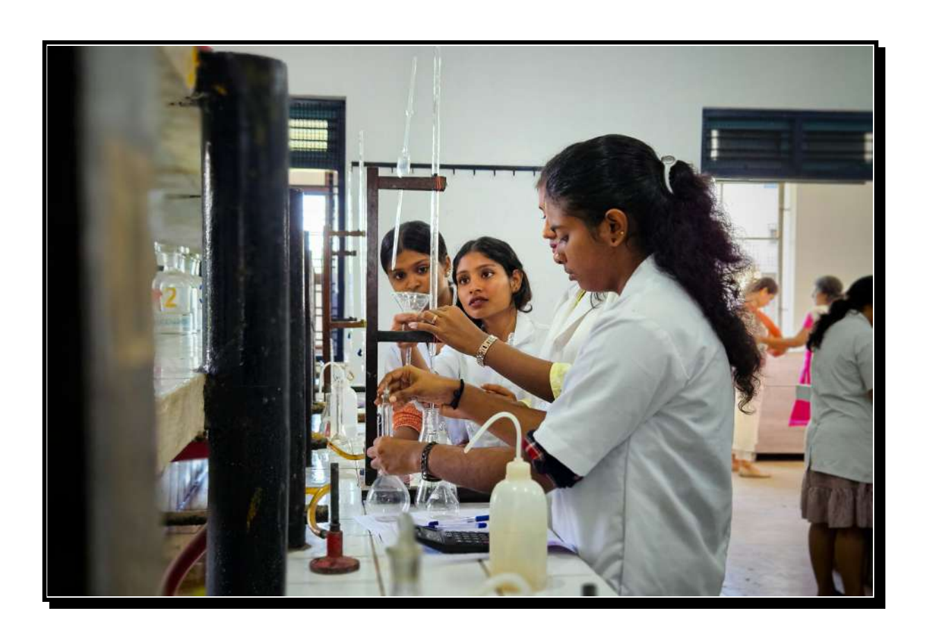
Figure 14: Students conducting practical experiments at undergraduate chemistry laboratory