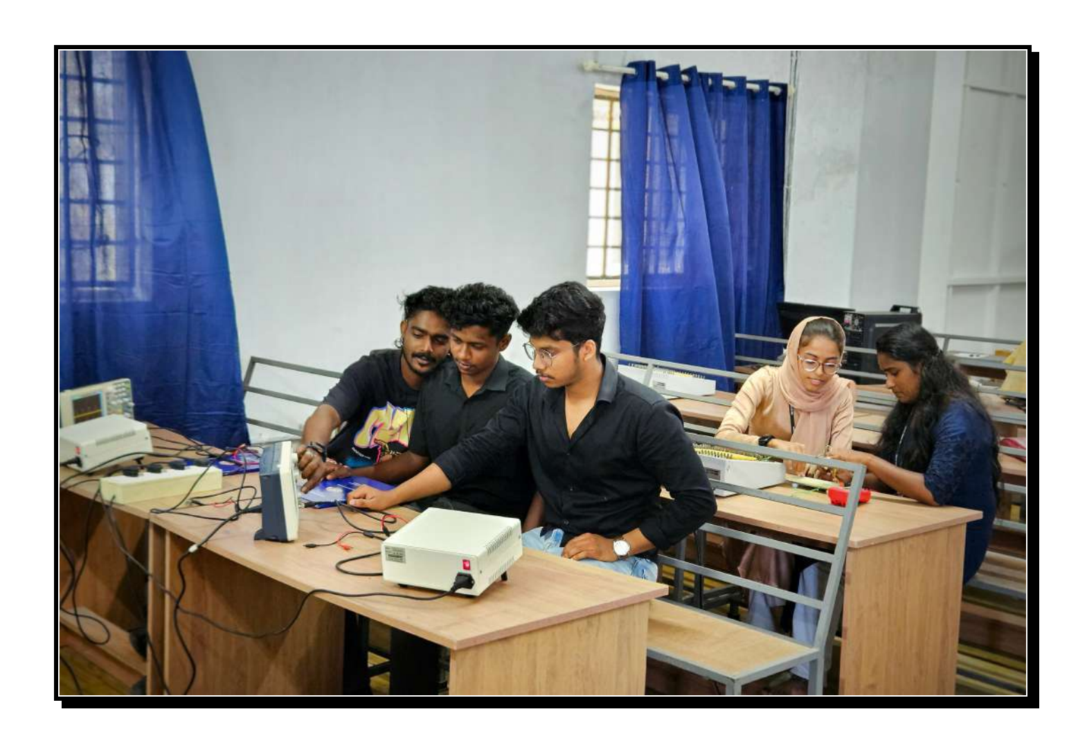
Figure 8: Students engaged in practical sessions in under graduate Electronics laboratory