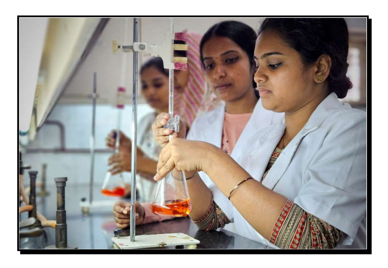
Figure 26: Students conducting practical experiments at Postgraduate Zoology laboratory