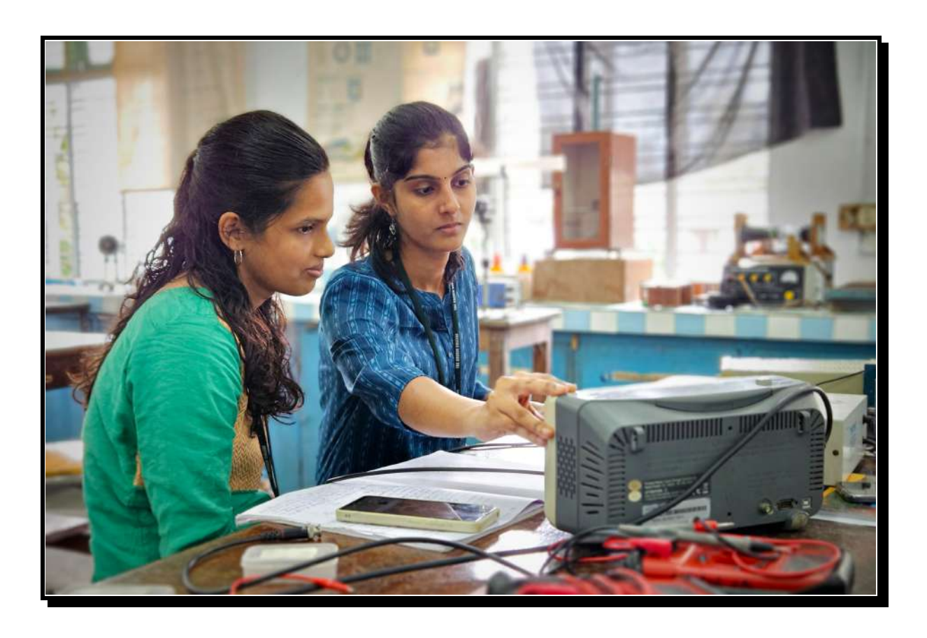
Figure 3: Students engaged in practical sessions in Post graduate Physics laboratory