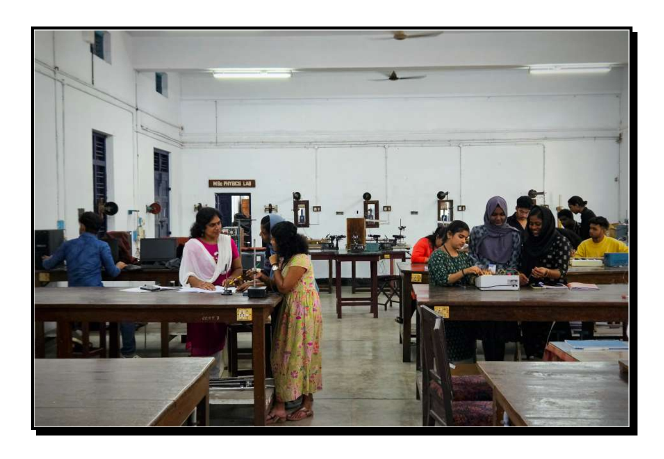
Figure 4: Students engaged in practical sessions in Under graduate Physics laboratory