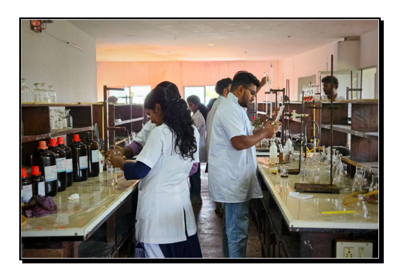
Figure 11: Practical sessions at Post graduate Chemistry laboratory