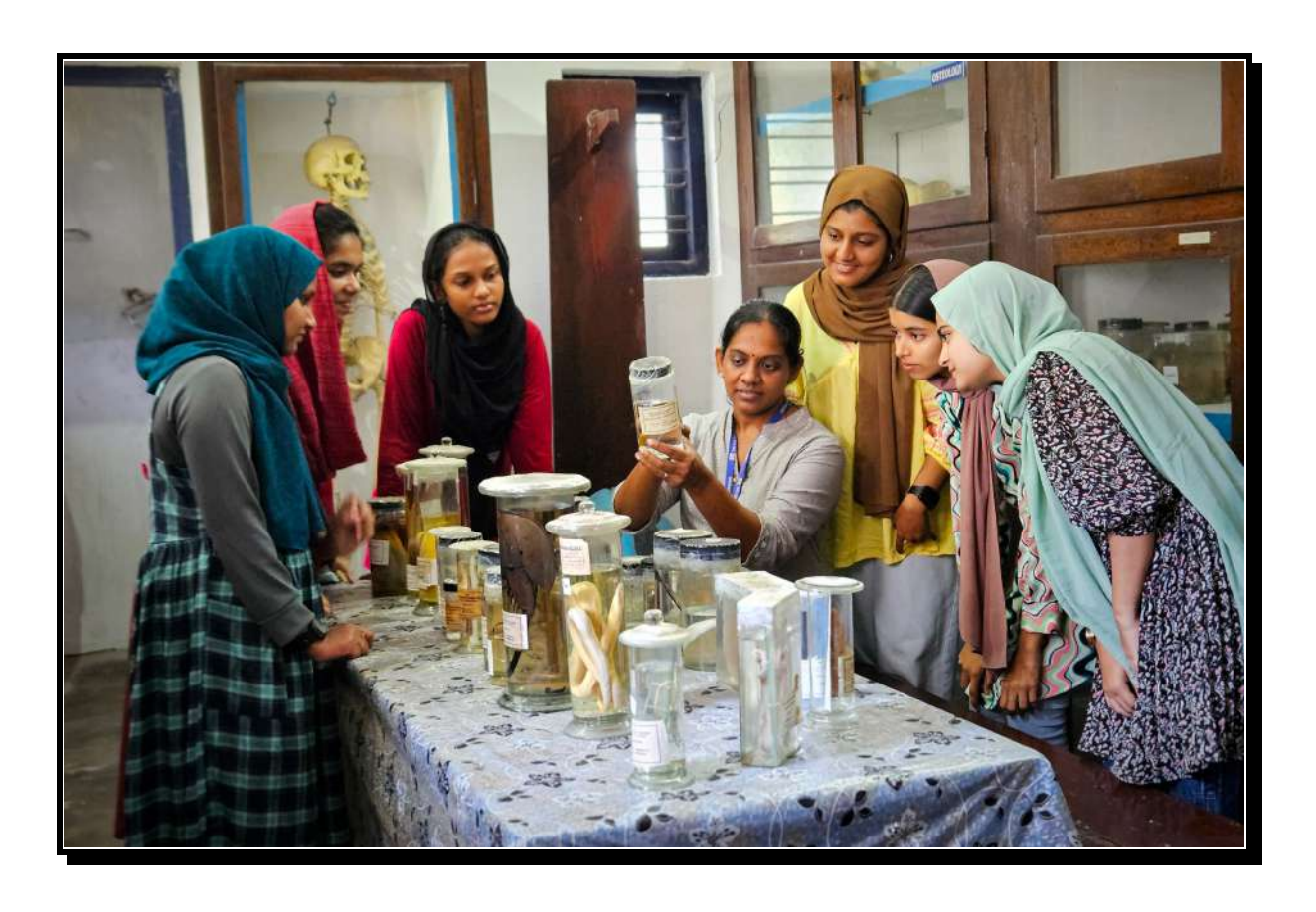
Figure 24: Faculty explaining different preserved biological specimens