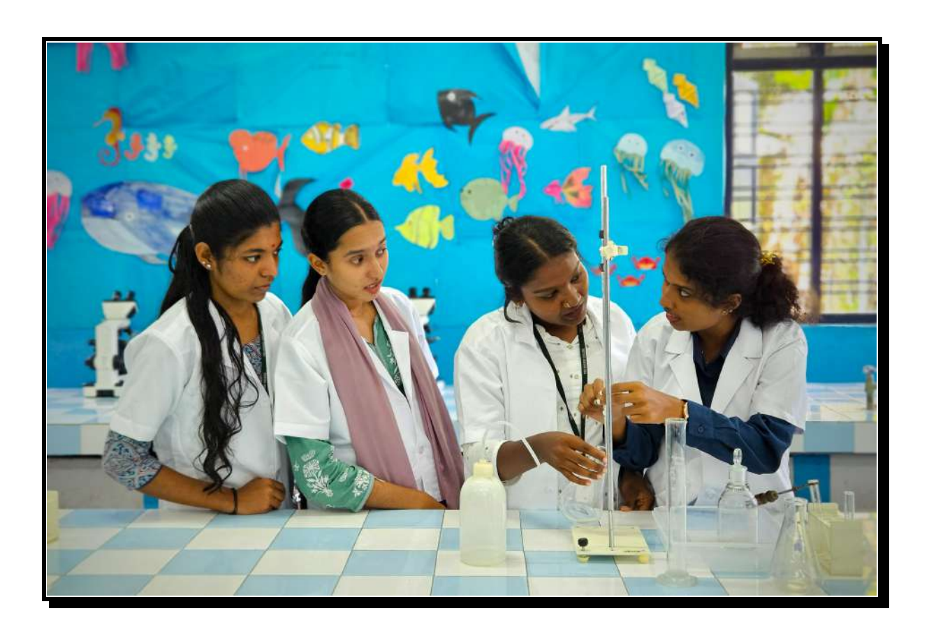
Figure 23: Students conducting practical experiments at undergraduate Zoology laboratory