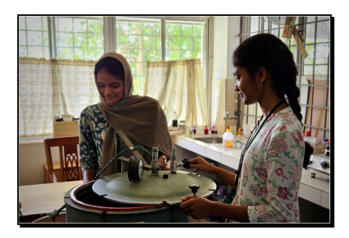
Figure 20: Biotechnology laboratory