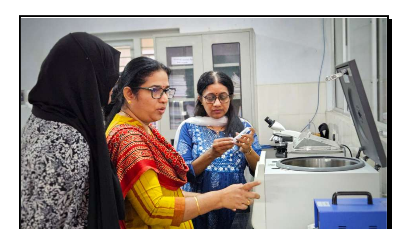
Figure 19: Botany instrumentation laboratory