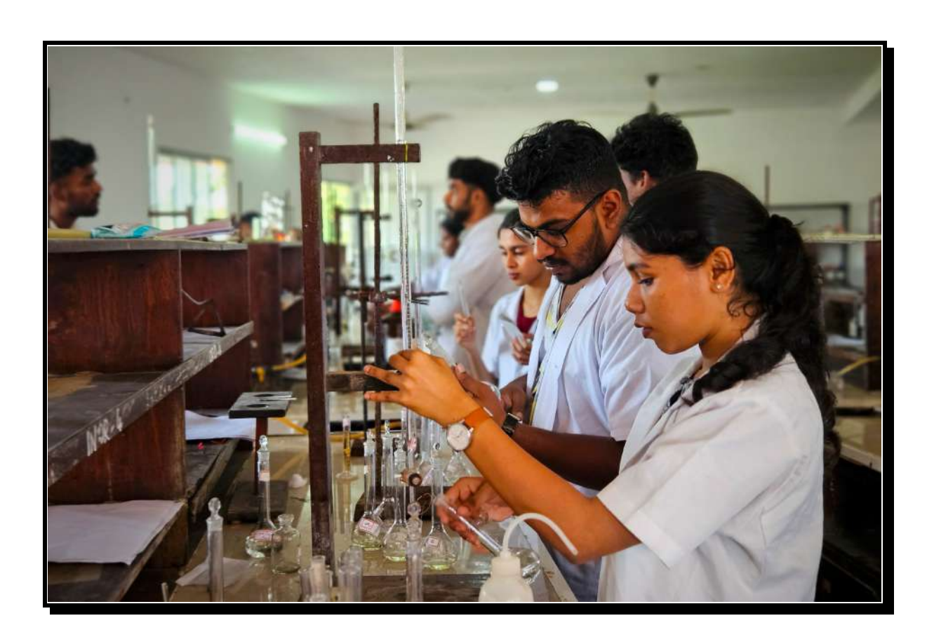
Figure 12: Practical sessions at Post graduate Chemistry laboratory