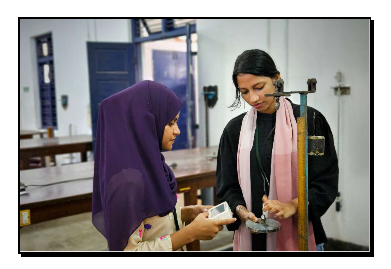
Figure 6: Practical sessions at undergraduate physics laboratory