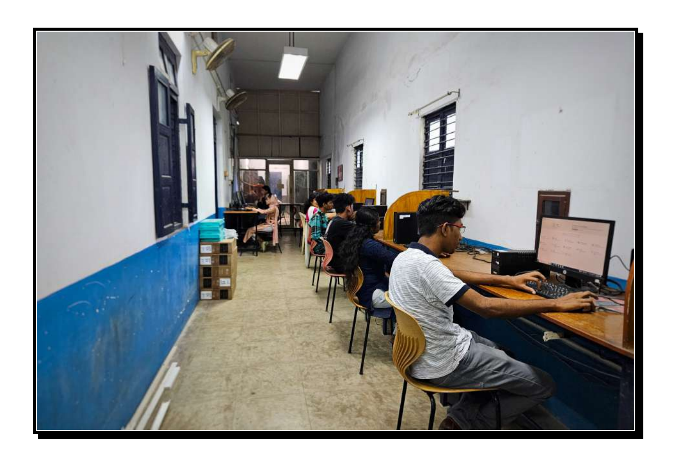
Figure 9: Students engaged in computational physics practicals