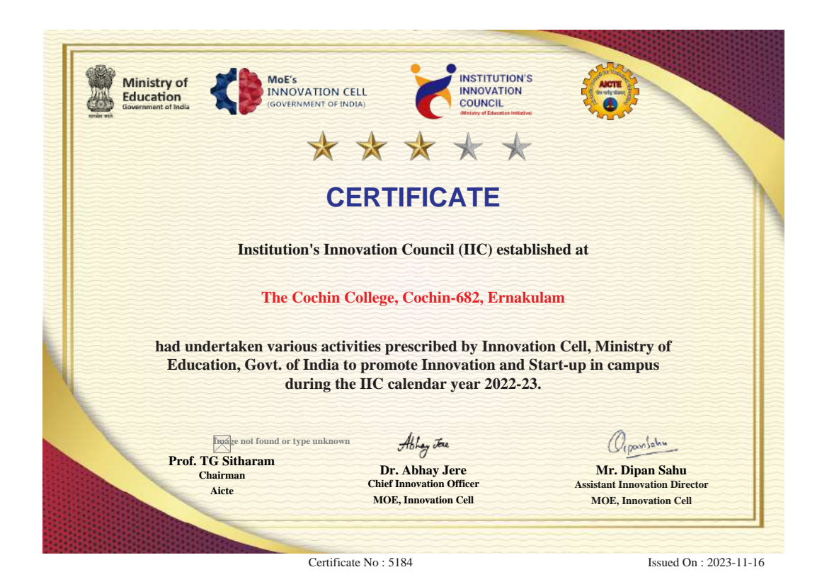
Figure 3: Caption for the photo

Website: www.thecochincollege.edu.in email: email@thecochincollege.edu.in