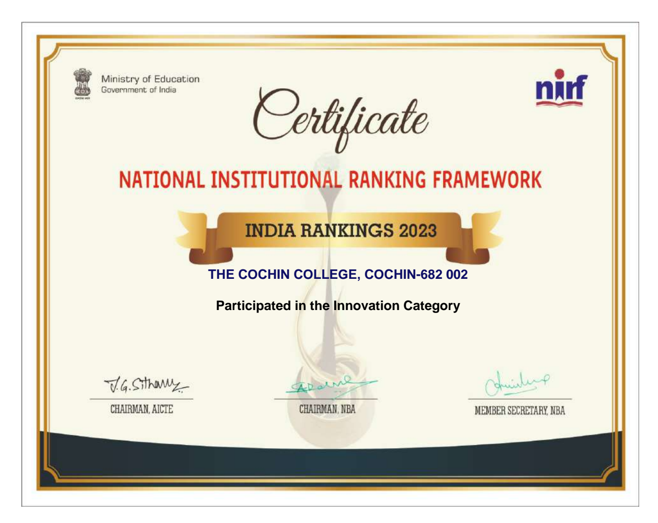
Figure 1: Caption for the photo