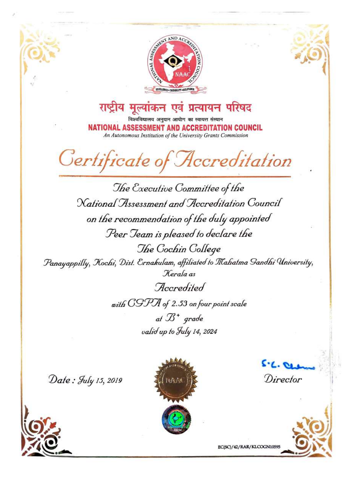
Figure 7: Caption for the photo