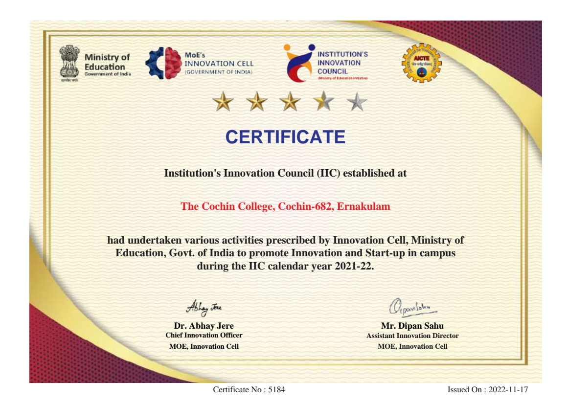
Figure 4: Caption for the photo

Website: www.thecochincollege.edu.in email: email@thecochincollege.edu.in