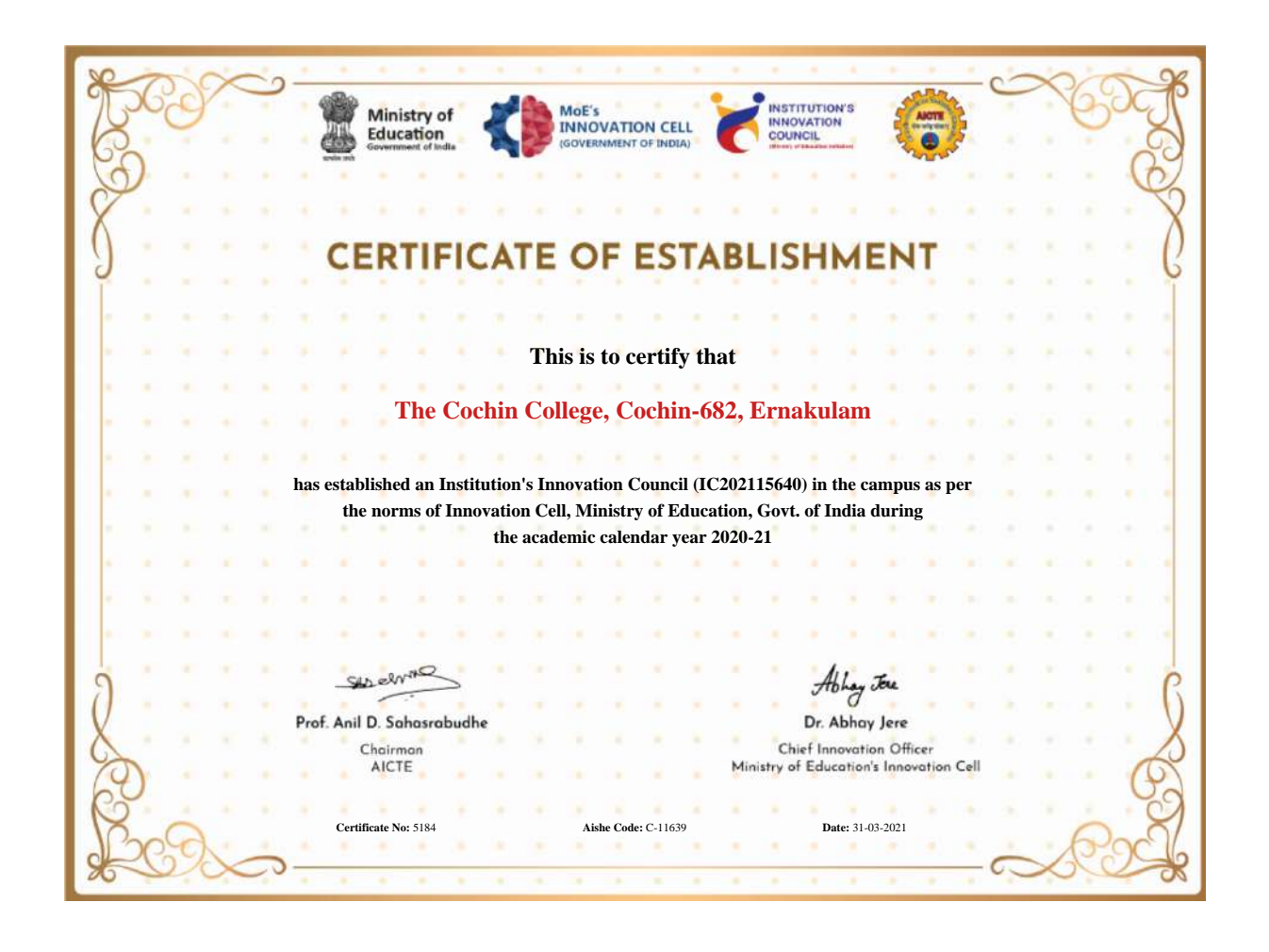
Figure 5: Caption for the photo

Website: www.thecochincollege.edu.in email: email@thecochincollege.edu.in