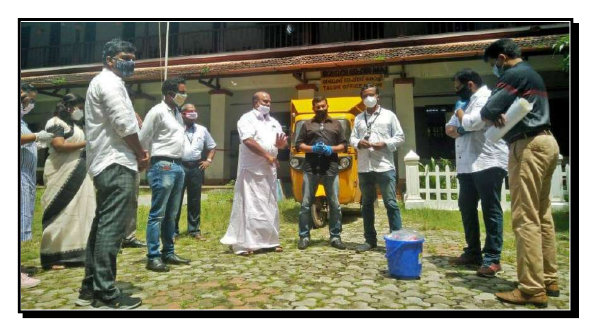
Figure 3: Support during Pandemic