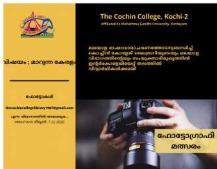
Number of Participants-10*

PHOTOGRAPHY: MAARUNN KERALAM - 07/11/2020