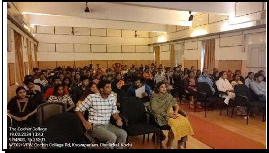
Figure 6: YIP Priming session