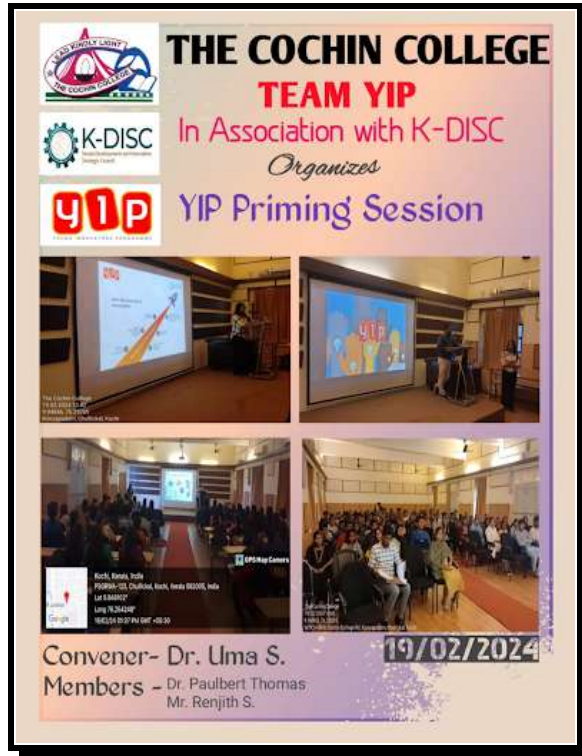
Figure 4: YIP Priming session