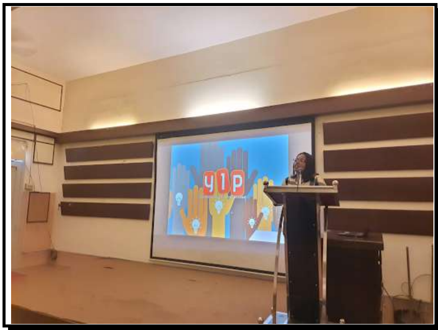
Figure 5: YIP Priming Session